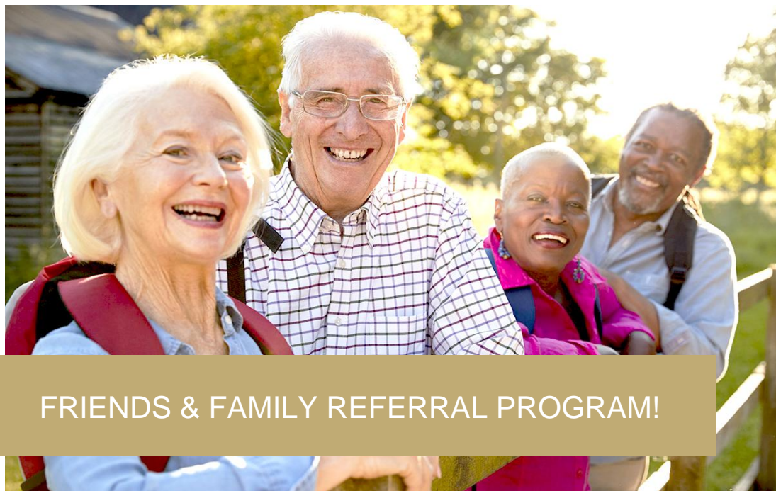
FRIENDS & FAMILY REFERRAL PROGRAM!