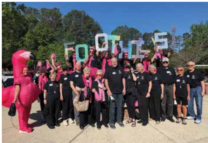
THE FOOTHILLS "FLAMINGOS"