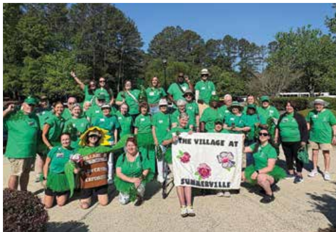
SUMMERVILLE'S "FLOWERTOWN ENFORCERS"