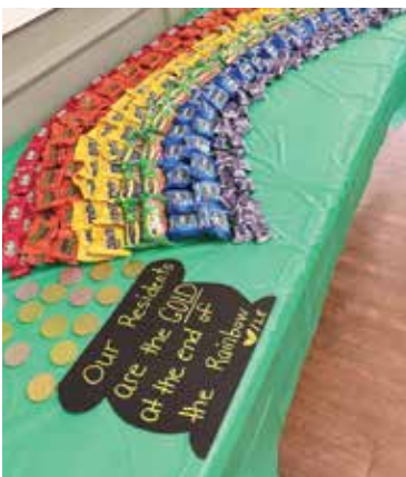
St. Patrick's Day was celebrated with some tasty treats, including a candy rainbow and a special St. Patrick's Day punch!