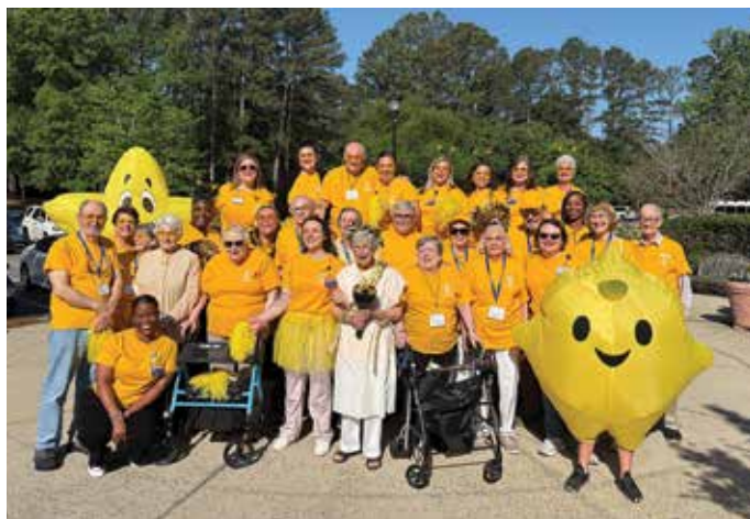
THE COLUMBIA "STARS"