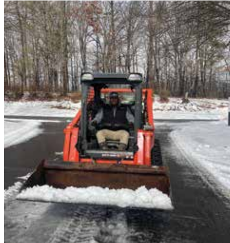
Maintenance Tech Stephen Byers kept the community roads all clear!