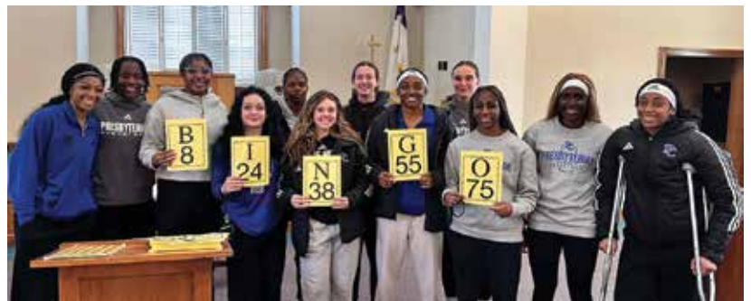
Presbyterian College student volunteers led a special afternoon of games and visits at the Clinton Community.