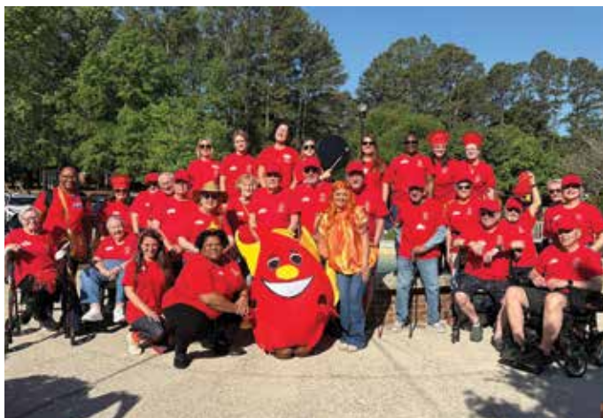
THE CLINTON "FLAME"