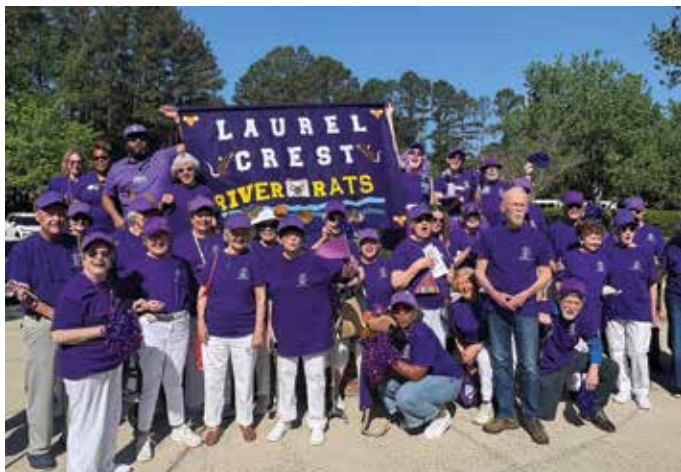
THE LAUREL CREST "RIVER RATS"