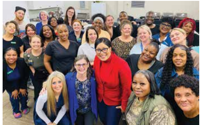
Staff from across PCSC's six communities participated in the Montessori Approach to Aging and Dementia Care introduction and refresher training program.