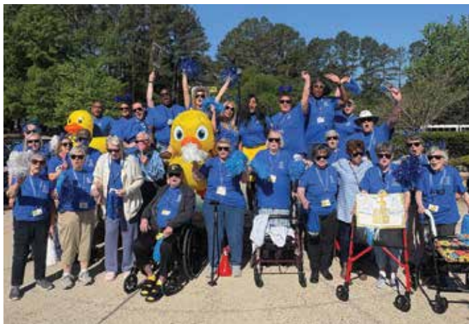
THE FLORENCE "MIGHTY DUCKS"