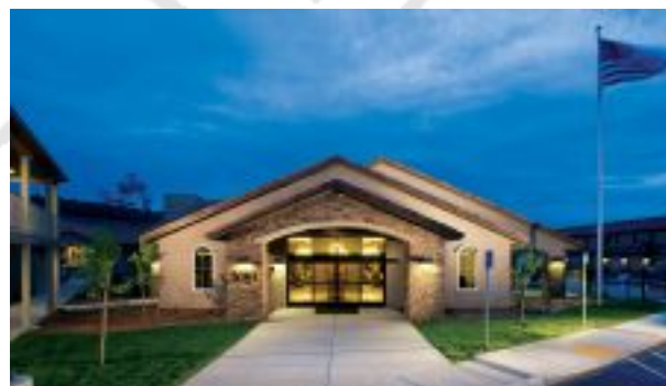
Ponté Palmero Resort-Style Living