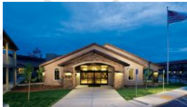
Ponté Palmero Resort-Style Living