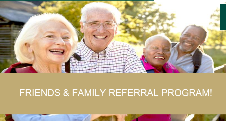
FRIENDS & FAMILY REFERRAL PROGRAM!