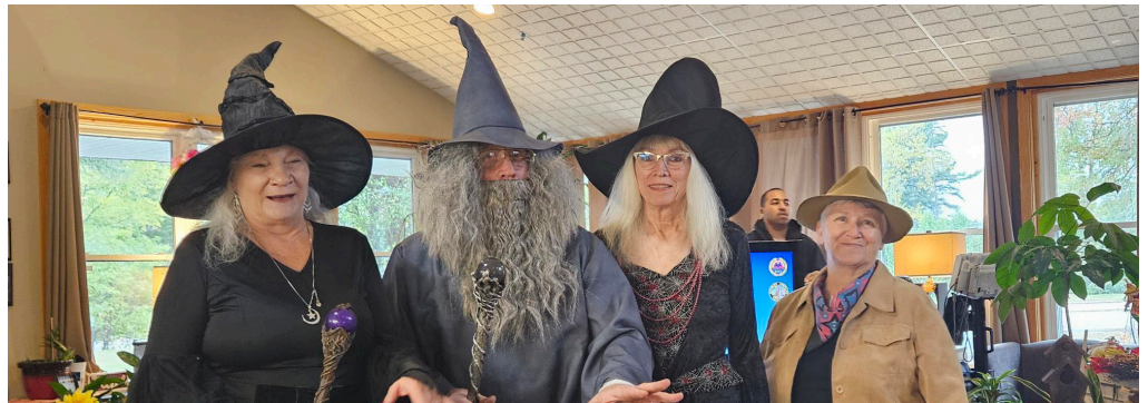
VFW gang even dressed up!

As the weather is getting colder and sickness spreads around, please remember to wash, wash wash! Hand hygiene and covering mouth and nose while sneezing/coughing is a great way to help prevent spreading germs and keeping everyone healthy!!