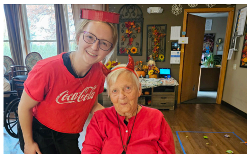
Halloween costume contest winners