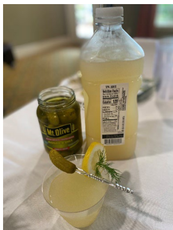
Pickled Lemonade Social

Download the InTouchLink app today! Stay connected to Waltonwood from the comfort and convenience of your smart device. The code to connect is 113573.