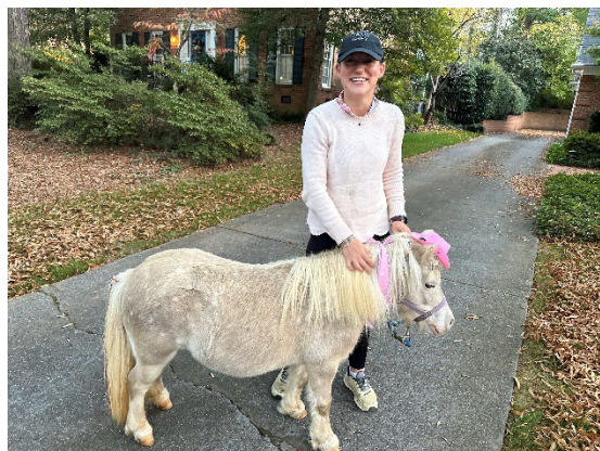
Our therapy pony "Suggie"