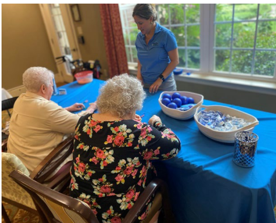
Fun and Games!