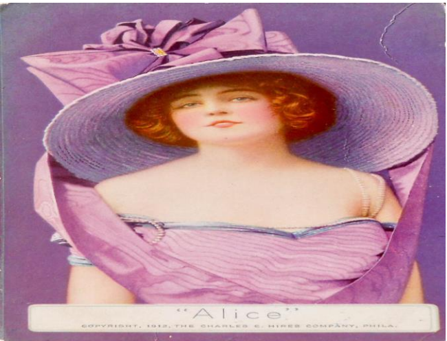
"Lovely in Lavender" Gorgeous Grandma Soiree

Welcome July! This month we welcome patriotic celebrations, beach weather, and summer vacations!