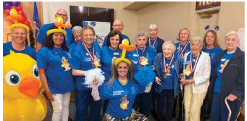
The Florence "Mighty Ducks" really make a splash!