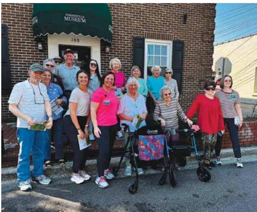
Residents from the Columbia Community and Laurel Crest enjoyed a day trip to Summerville to find the bird sculptures in downtown Summerville.