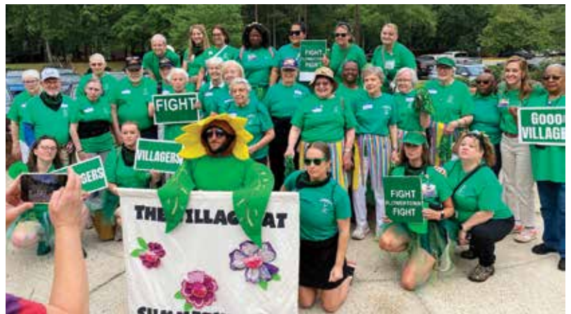
The Village at Summerville "Flowertown Enforcers" are looking sharp!