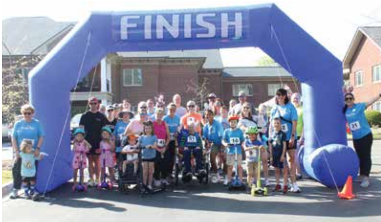
Above: Participants in the Bunny Hop 5K.