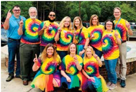
The Management Services Office cheerleaders are ready to support participants from ALL the communities!