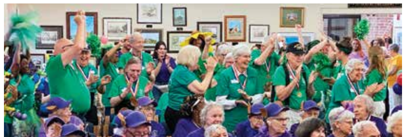
Summerville residents erupt with cheers upon earning the highest point totals!