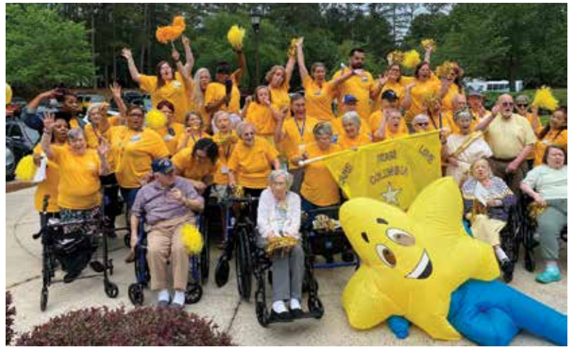
The Columbia "Stars" show their team spirit.