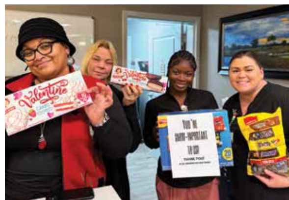
Columbia staff members enjoy snow day treats: You're SNOW important to us!