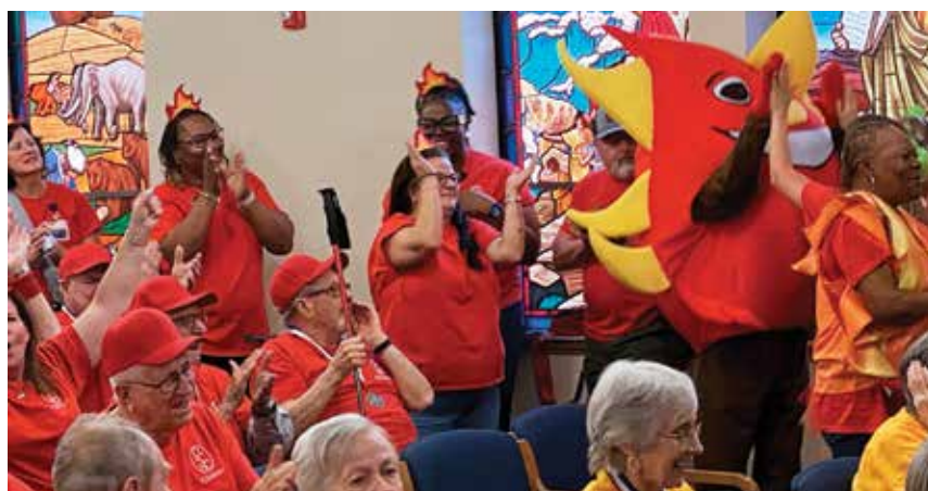
The Clinton "Flame" cheers loudly upon receiving the Spirit Award.