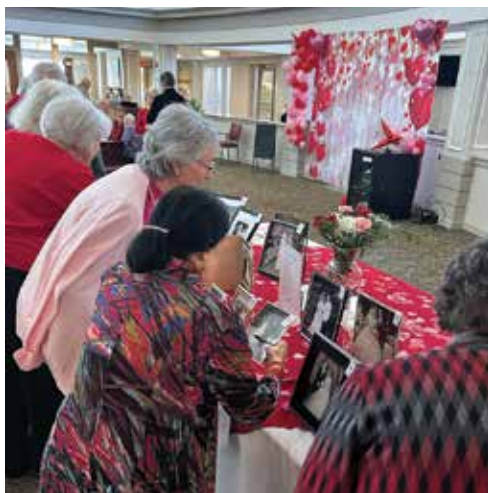
Residents make their best guess at identifying other resident couples in vintage photographs.