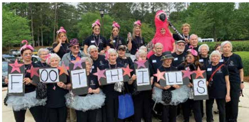
The Foothills "Flamingos" are ready for the competition to begin.