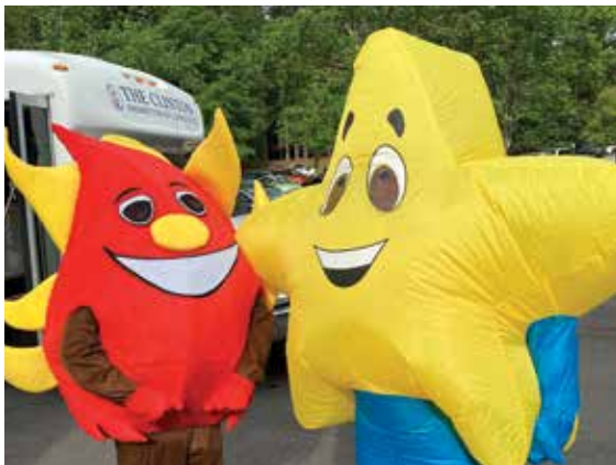
Mascots for Clinton and Columbia