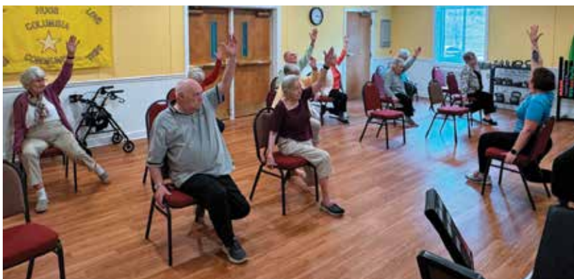
Residents stay flexible and manage stress in Chair Yoga class.