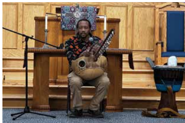
Residents enjoyed learning about West African drumming to celebrate Black History Month.