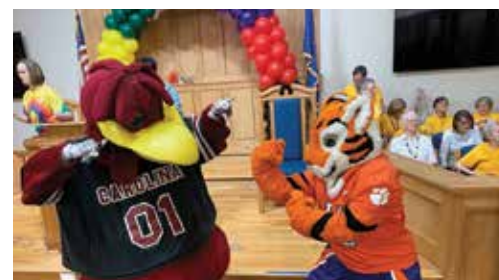
"Cocky" and the Clemson Tiger get in on the action!