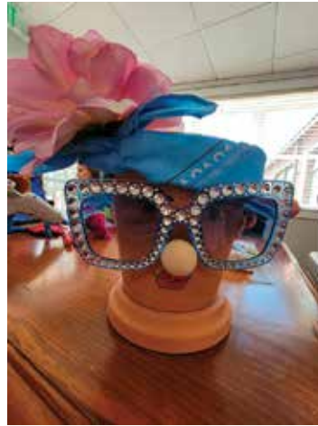
One of the finished products!