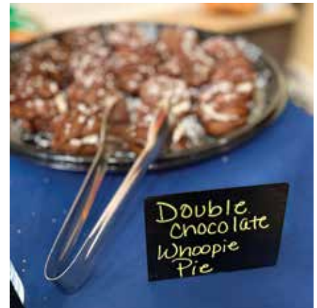
The Cookie Challenge winner.