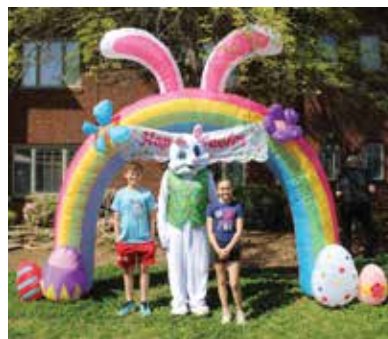
Right: Children pose with the Easter bunny, while another young hunter enjoys the Easter egg hunt!