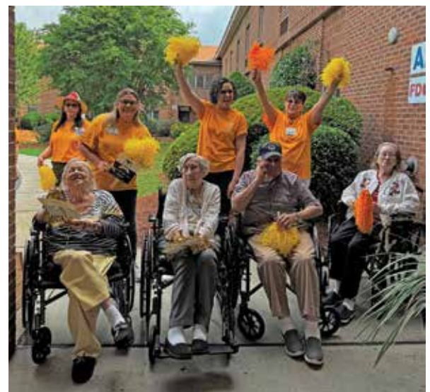
Residents and staff cheer at the PCSC Olympics.