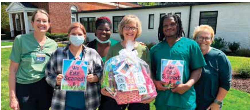
Members of the Therapy Department show off their prizes.

The Great Egg Escape was played as a team-building exercise among the various departments at the Florence Community. Each team had to explore "Farmer Pickle's Field," "The Chicken Coop," "Down the Rabbit Hole," and "Mama's Tulip Garden" to gather clues and figure out lock codes to make it to the finish line. Congratulations to the Therapy department for their outstanding teamwork that led them to victory!