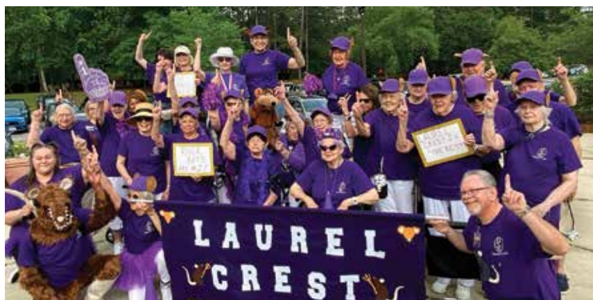
The Laurel Crest "River Rats" gather for a pre-game photo.