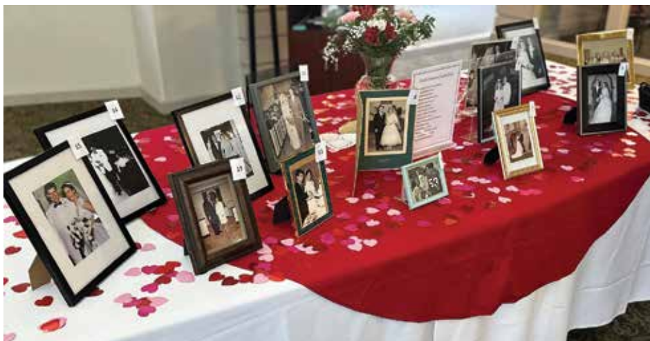
Fifteen Foothills couples shared photos of themselves as sweethearts or newlyweds during the Valentine Day celebration. The challenge: Identify each couple!