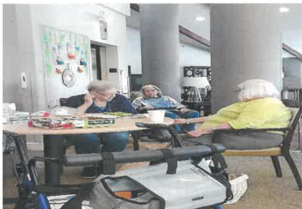
Knit & stitch group