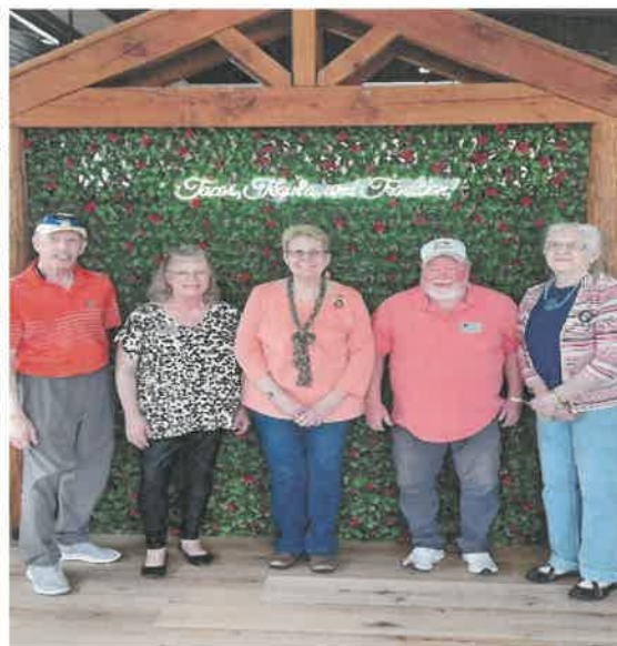
Lunch at Mi Placita Redmond