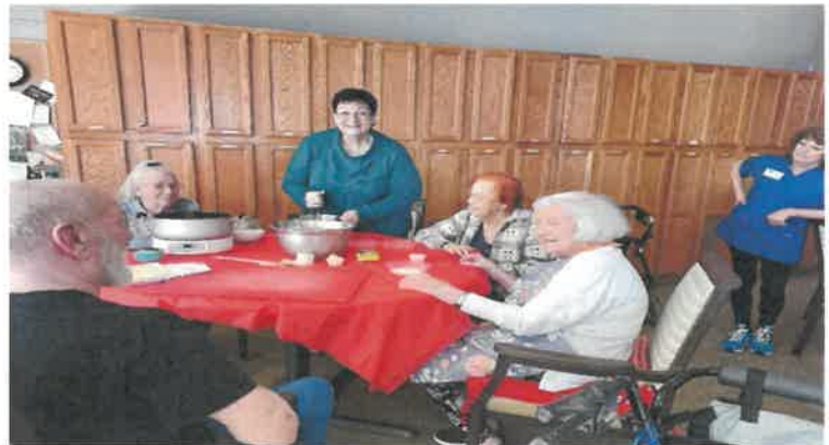
Jam Time again!