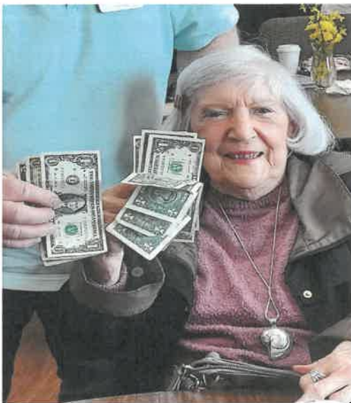
Sr. Center Bingo winner!