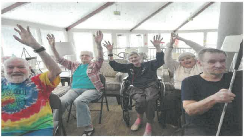
Morning Yoga class