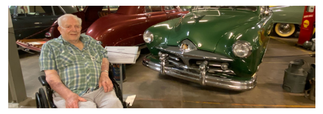
Don car museum