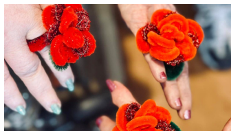
Rings made in Creative Hour