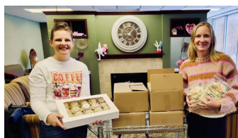
Curds & Cookies Donation