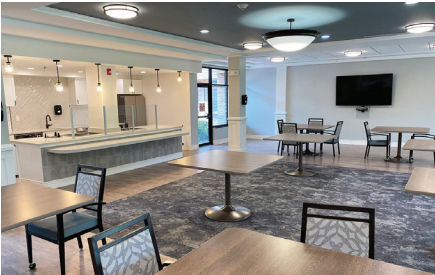
The nurses station and dining room at Cassels Health Care Center at the Columbia Community.

Columbia | A significant renovation to the Cassels Healthcare Center, accomplished in several stages over the last two years, was completed in 2024! With significant support from the estate of Harold M. Bryant, the renovation included building new private rooms, dining space, therapy space, and renovating existing semi-private rooms into private rooms with in-suite baths.