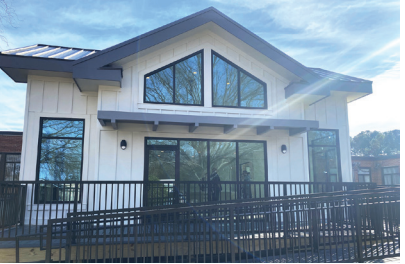
The renovated Chapel (left) and the Pavilion (right) at the Florence Community.