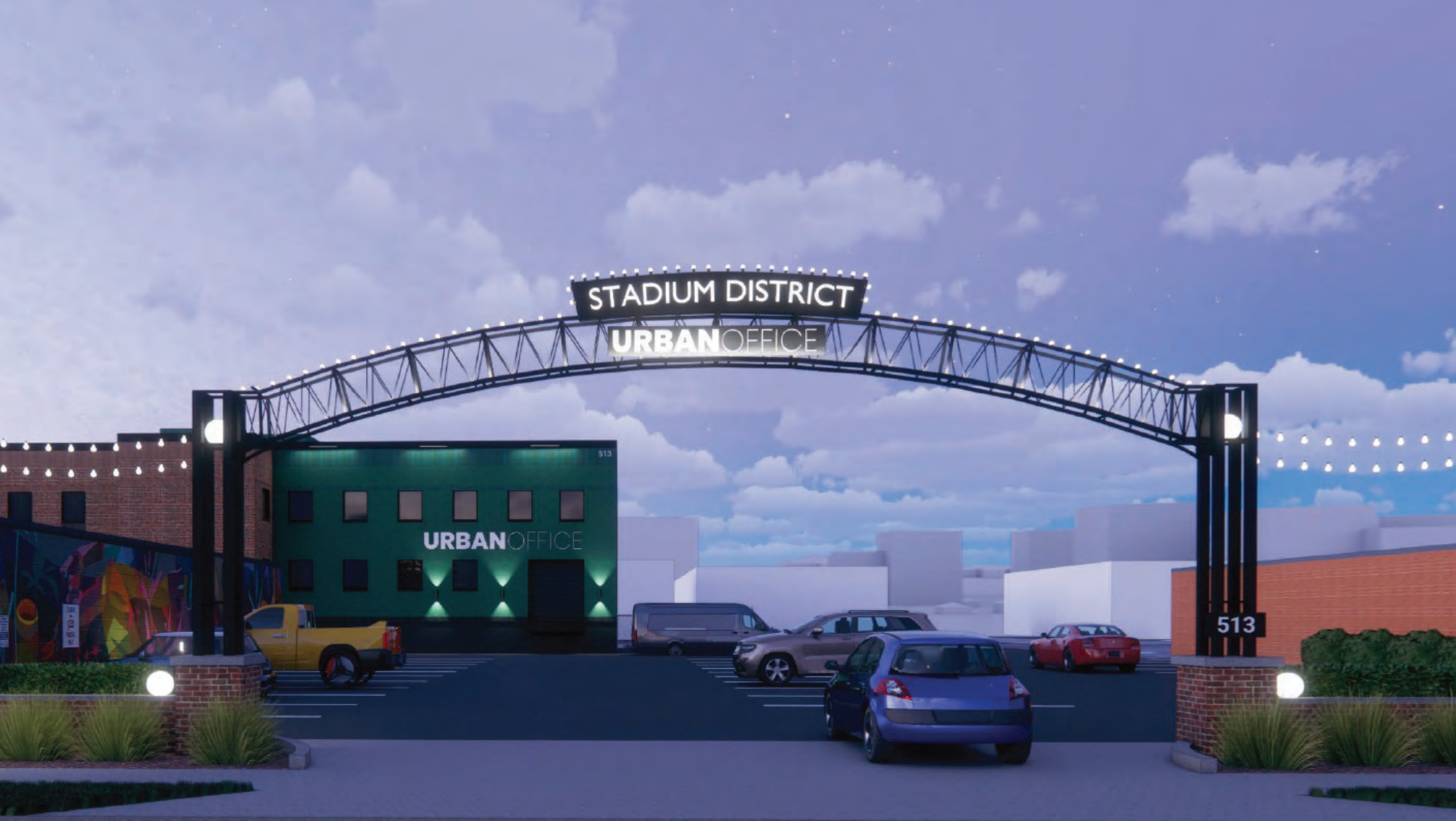
VIEW FROM E. SHIAWASSEE STREET