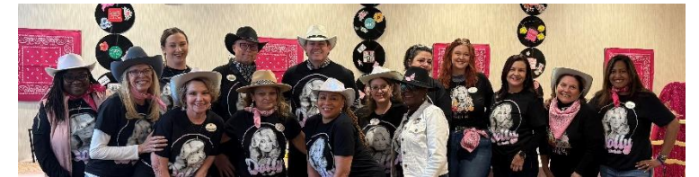
Dollywood Week! Waltonwood Ashburn Team