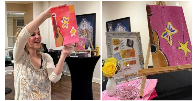
AL Family Paint Night Book Drive!