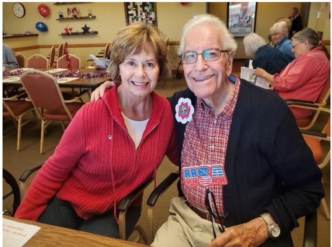
Veteran's Day Celebrations!