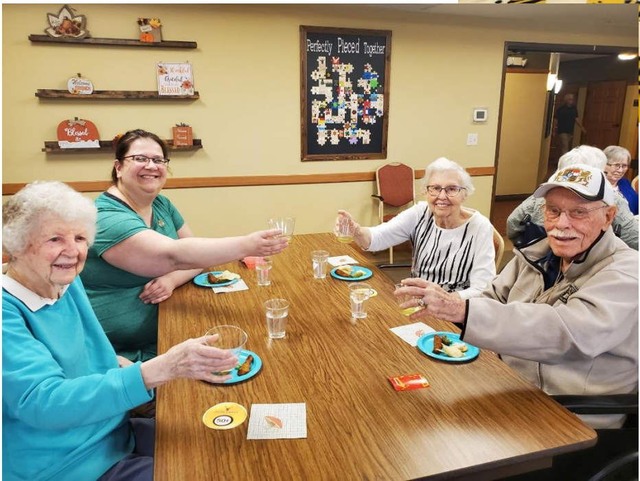
National Pickle Day – Pickle Juice Shots!