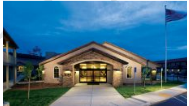
Ponté Palmero Resort-Style Living