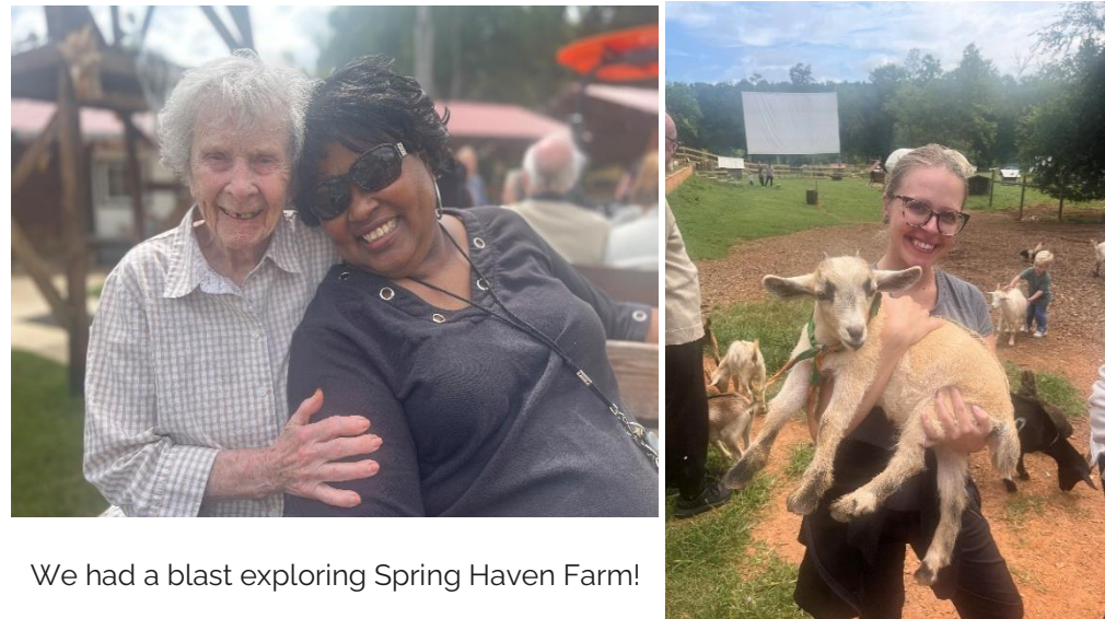
We had a blast exploring Spring Haven Farm!