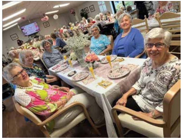
Above: The Mother's Day Luncheon had a great turnout! The ladies enjoyed a delicious brunch, good company and shared some of their best memories of being a mother.