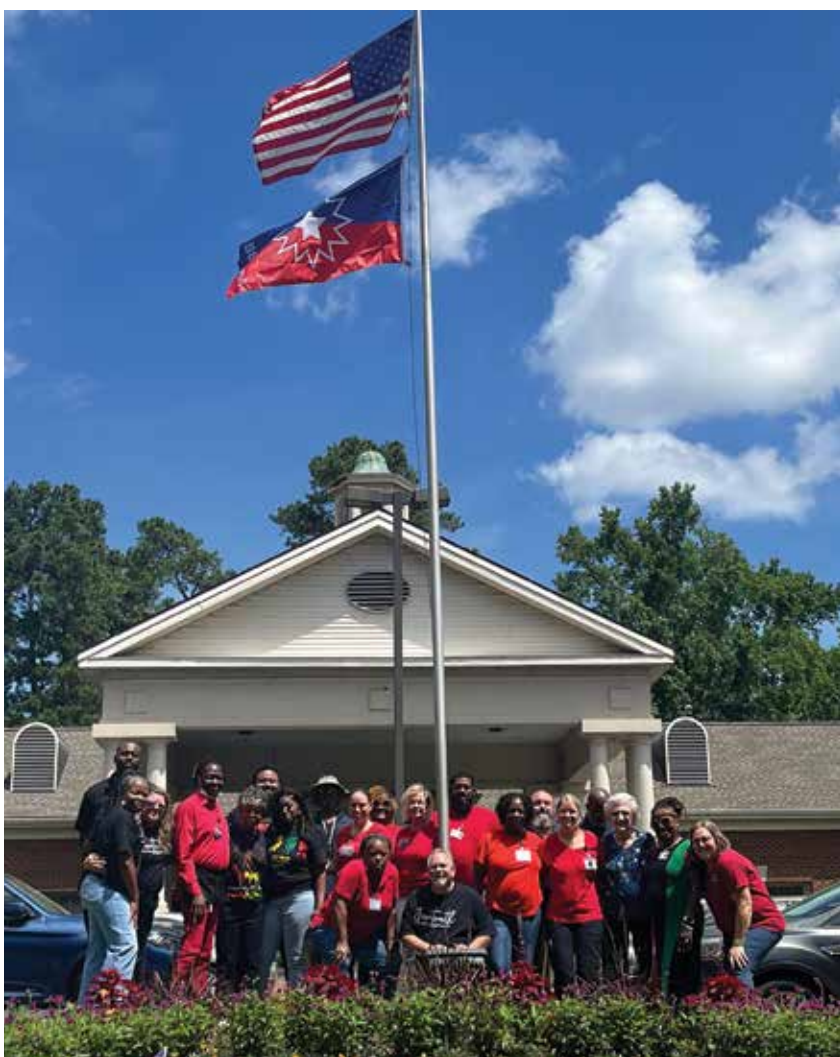
Residents and staff joined at the flagpole while raising the flag to honor Juneteenth.