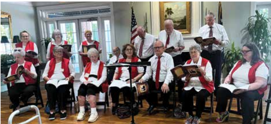
The Jubilant Singers honored Laurel Crest with a wonderful concert of old hymns.