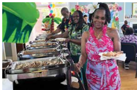
The wonderful team at Laurel Crest helps make this a special place. This year, the community celebrated those with work anniversaries at a fun, tropical-themed luncheon.