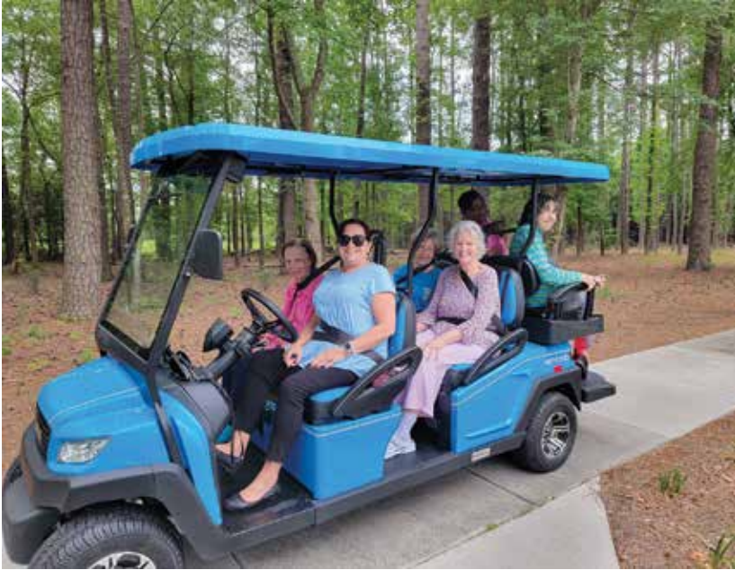
Residents enjoyed getting some fresh air while taking a ride in the new golfcart.