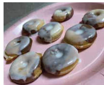
Below: Final product of the baking class!