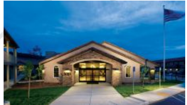
Ponté Palmero Resort-Style Living