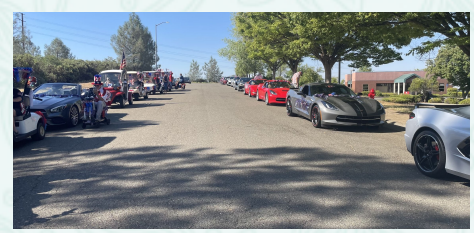
Cameron Park Fire Department