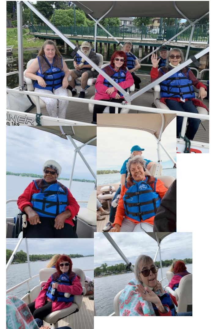
Our next summer picnic will be July 2 nd with entertainment by the Flora's