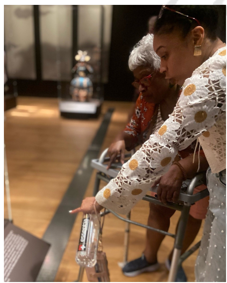
The VA Fine Arts Museum: The Samurai Exhibit