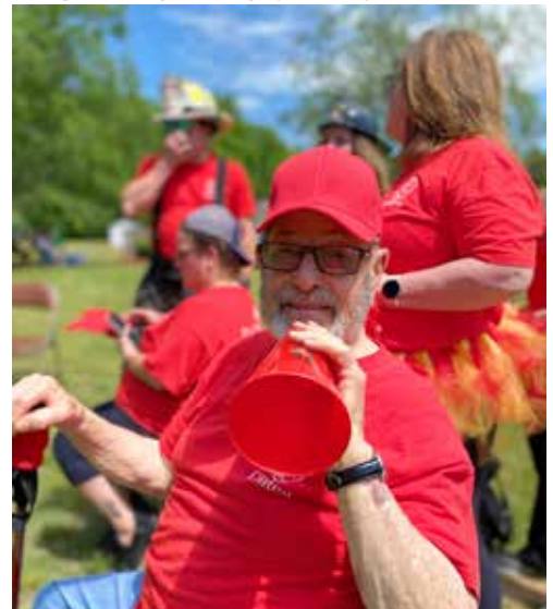
Loud and proud to be a Clinton supporter.