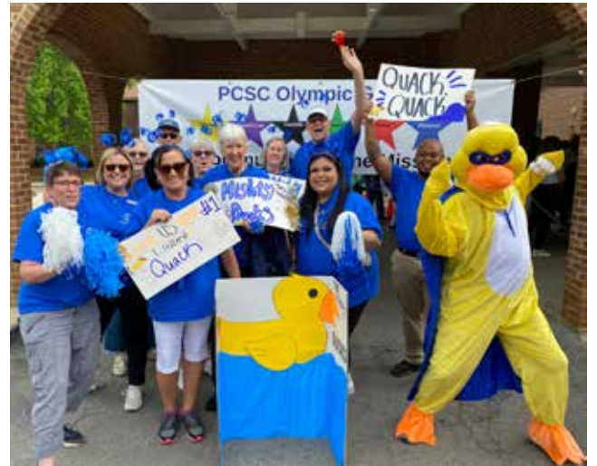
Cheering on the Mighty Ducks of Florence.