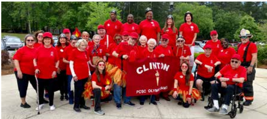
The Clinton Community was fired up and ready for the red carpet at this year's Olympics.