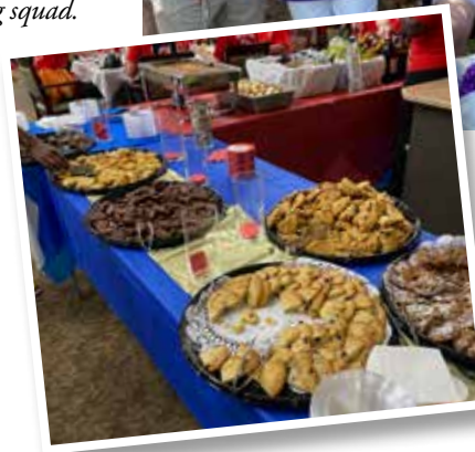
Desserts, anyone!? It was fun to taste the various cookies and vote for the best!