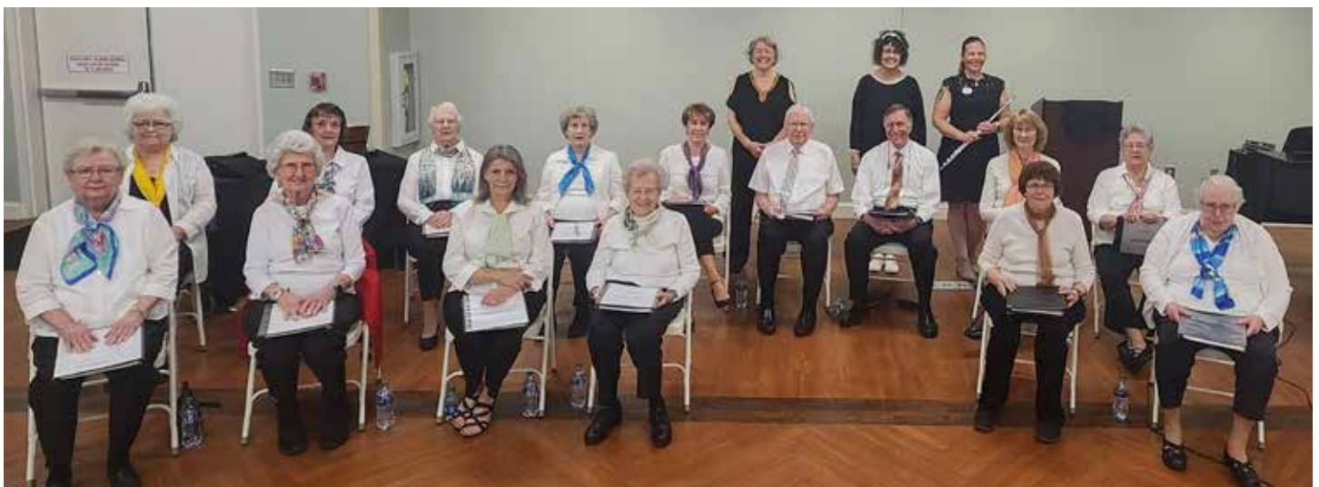
The Saints Alive Choir traveled for the first time since well before COVID and performed at Lexington Medical Center Extended Care.