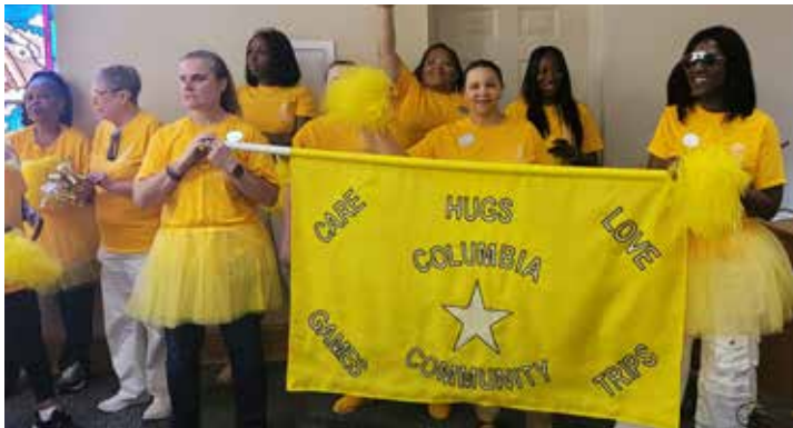
Spirit Award winners from the Columbia Community's cheering squad.