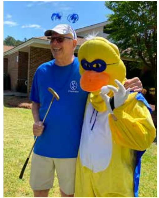
Representing the Mighty Ducks from Florence.