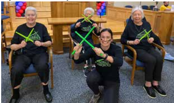
Foothills Fiddlesticks provided entertainment.