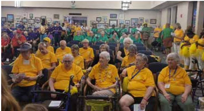
Waiting for the winners to be announced.