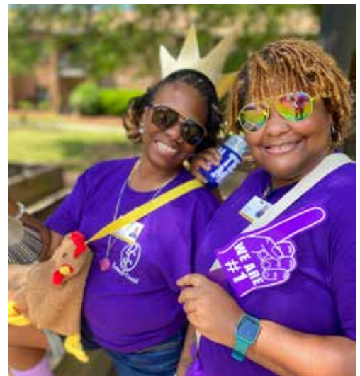
Laurel Crest's cheering squad!