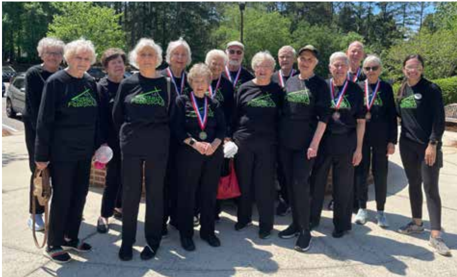
The Foothills participants, medal winners, supporters and Fiddlesticks.