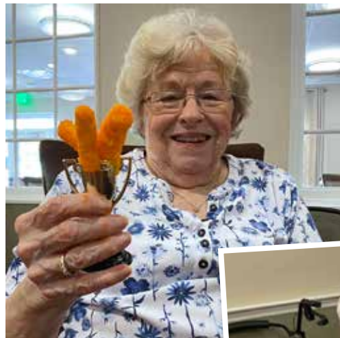
“It’s Not Easy Being Cheesy!” Residents celebrate National Cheetos Day by doing all things cheesy!