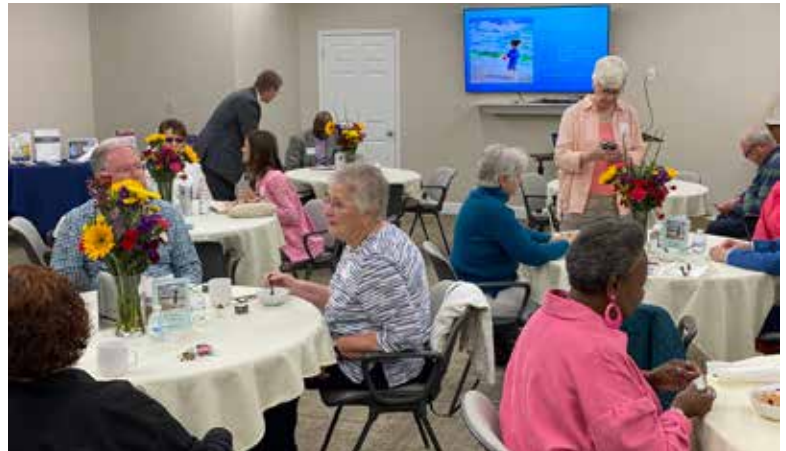
Ambassadors from the PeeDee area renew friendships and learn more about the annual Mother's Day Offering.

After lunch, participants were treated to tours of the communities, getting up-close looks at life in Presbyterian Communities. We are deeply indebted to our Ambassadors who serve as our very best Mother's Day Offering cheerleaders in their congregations.