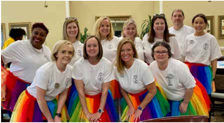
These cheerleaders were ready to support participants from ALL the communities!