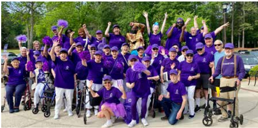
PCSC Olympics Grand Prize winners, Laurel Crest, celebrate their victories.