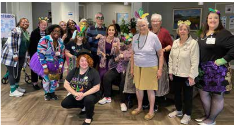
Residents and staff members from across The Village participated in a colorful Mardi Gras Parade. Let the good times roll!