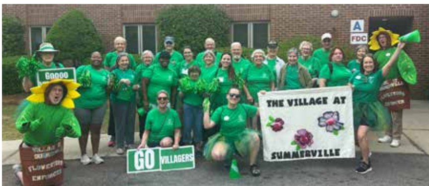
"The Flowertown Enforcers" – also known as The Village at Summerville.