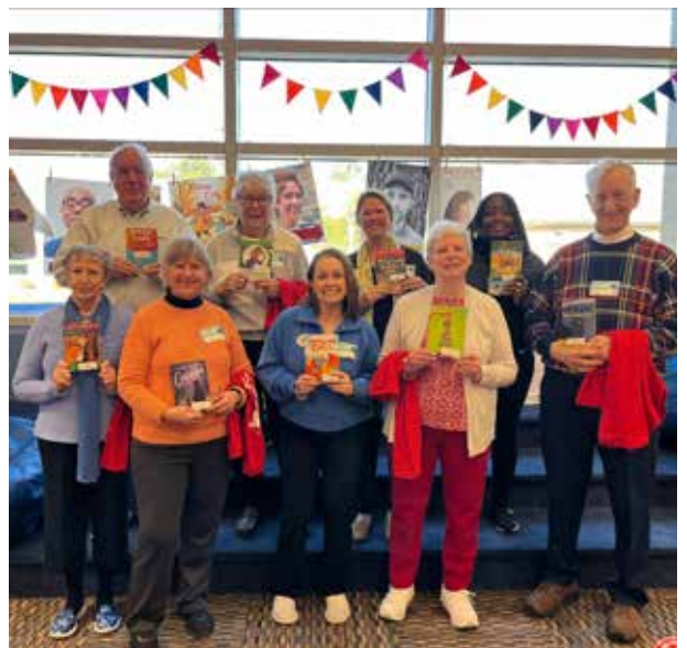
Right: Residents are so excited about the Pye Buddies Reading Program. This group will go to Joseph Pye Elementary the third and fourth Fridays of every month to work with 3rd graders to improve their reading levels. Plans are even underway for the students to take a trip to The Village to see where their book buddies live.