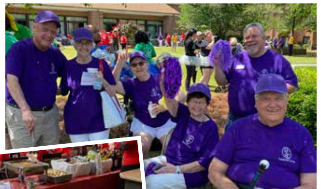
Cheering on Laurel Crest!