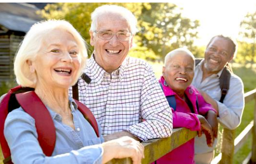
FRIENDS & FAMILY REFERRAL PROGRAM

Taurus and Gemini are two different signs on the zodiac wheel, and they can have a dynamic pairing, but also some friction. Taurus is an earth sign, and Gemini is an air sign, and they have different personalities. Taurus is stable and reliable, while Gemini is reckless and loves surprises. Taurus values the material world, emotions, and stability, while Gemini values the universe, ideas, and change.