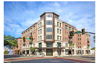
Hoffler Place in Charleston, SC

CLS manages a student housing portfolio consisting of over 28,000 beds inclusive of this latest assignment. The CLS team has built a best-