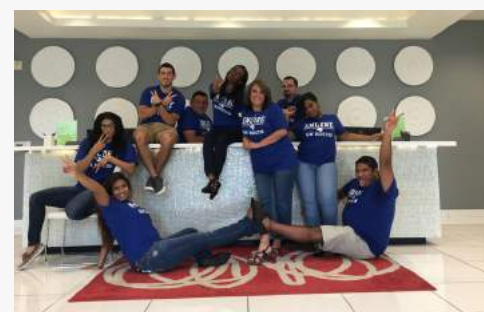
The Encore staff strikes a pose