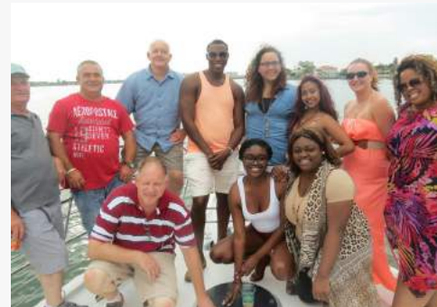
The Ivy works hard and plays hard