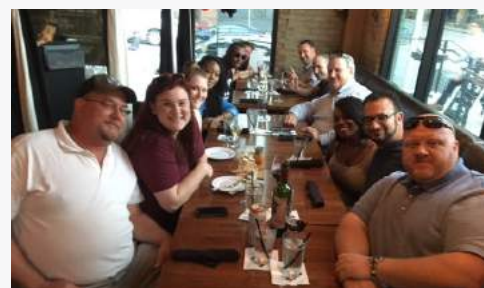
CLS team members grab dinner in Austin

Submit your most creative Resident Event (description and photo) for the next edition and the winner will receive a $50 Starbucks gift card!