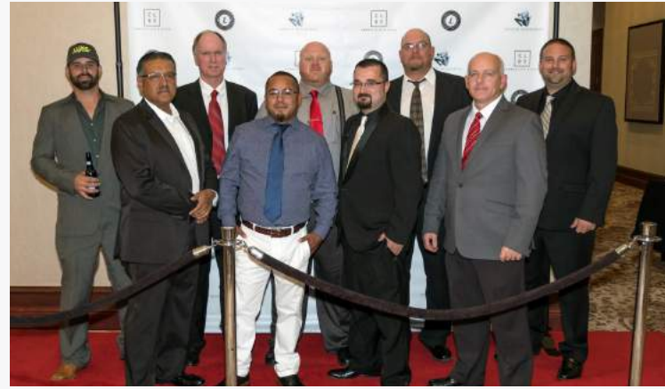
Members of the facilities team at The Legacy Awards