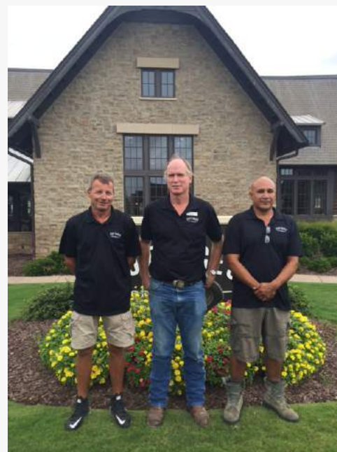
The Cottages maintenance team model their uniforms

Show your CLS pride! Post a picture on social media with the hashtag #CLSNewsletter for your chance to have your picture featured in the next edition.