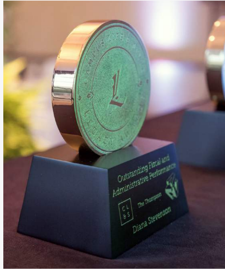
A prestigious Legacy Award