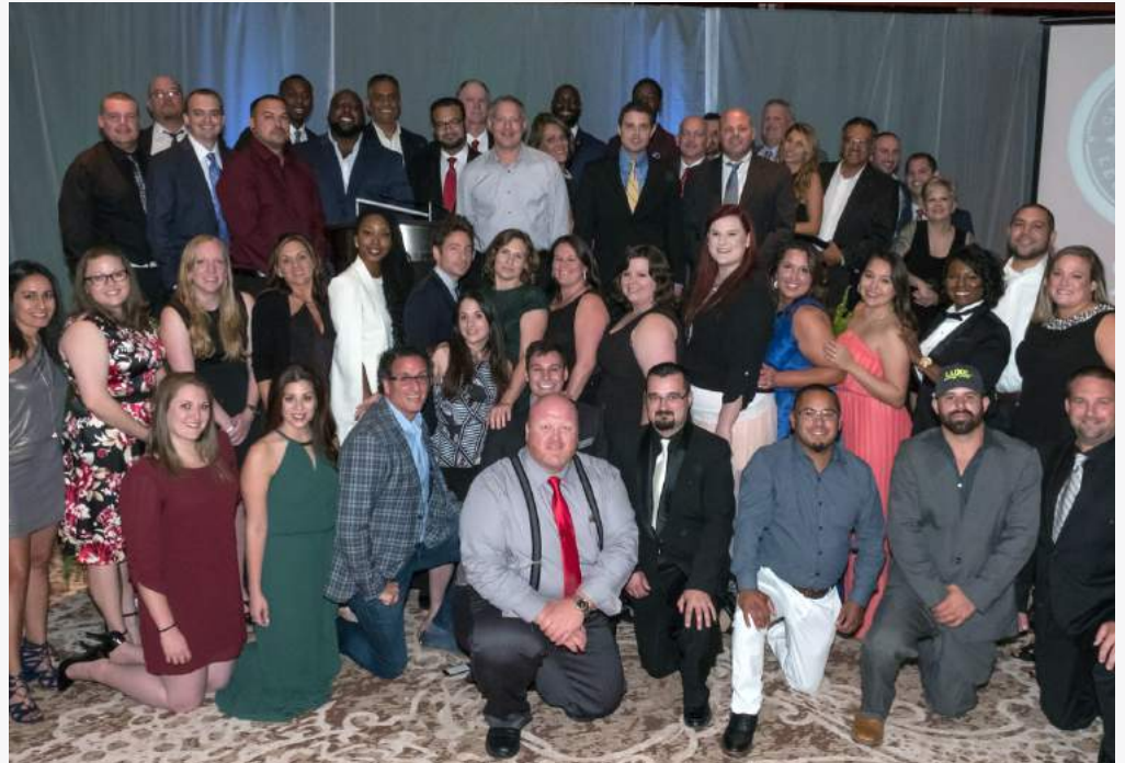
Members of the CLS and Vesper teams at The Legacy Awards

The ladies and gentlemen of Vesper Holdings and Campus Life & Style enjoyed a magical evening of celebration as the first ever Legacy Award nominees and winners were announced. The Legacy Awards represent five categories of excellence, where twenty of Campus Life & Style's finest were nominated and then awarded as the top team member in each area.