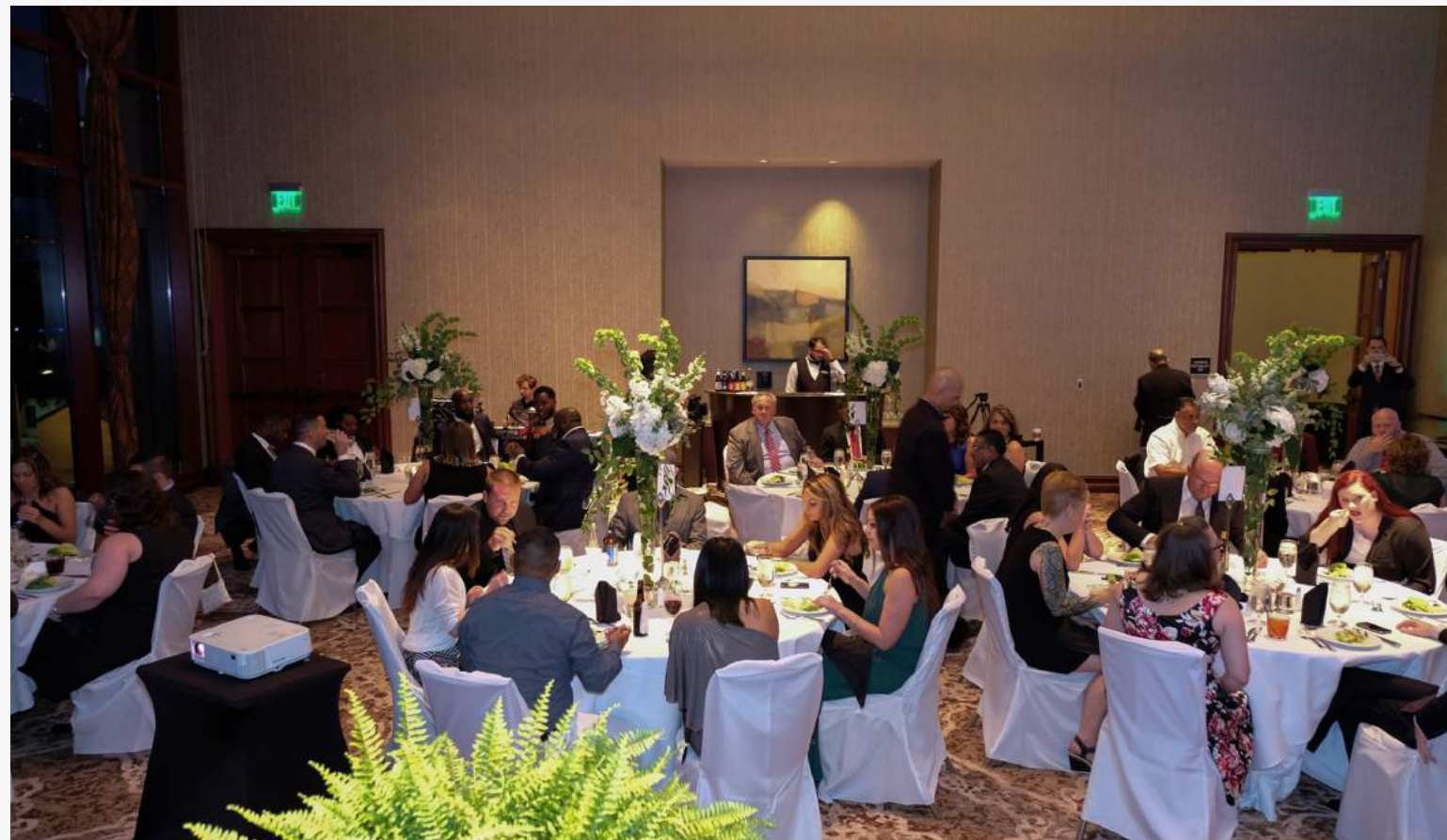
The Legacy Awards dinner