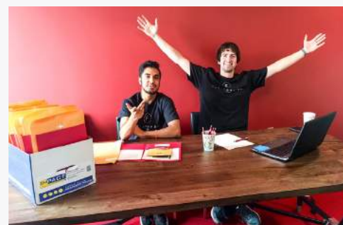
Getting those leases at The Foundry