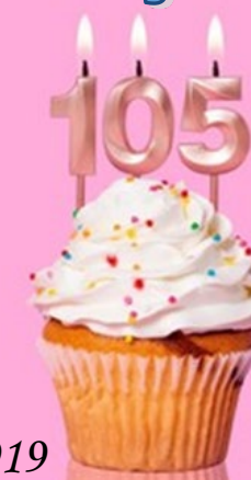
Born March 15, 1919