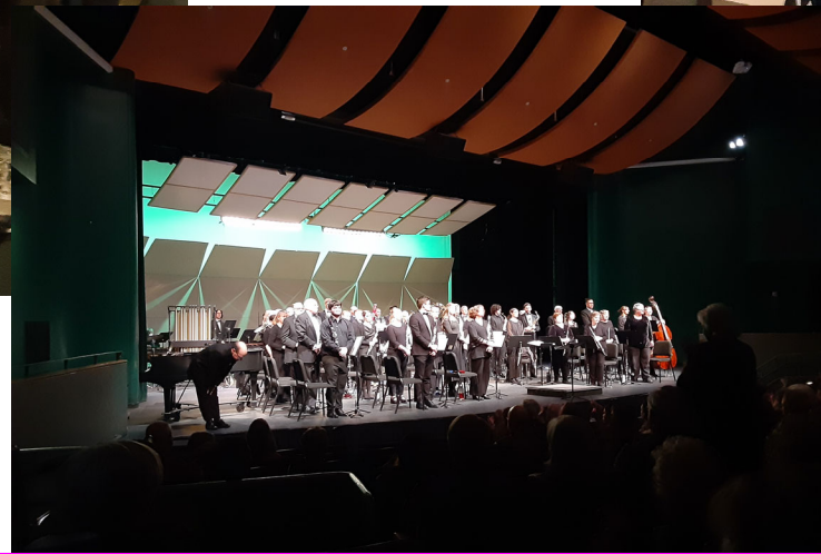
Central Oregon Symphony (2/25) and Cascade Winds Symphonic Band (3/10)