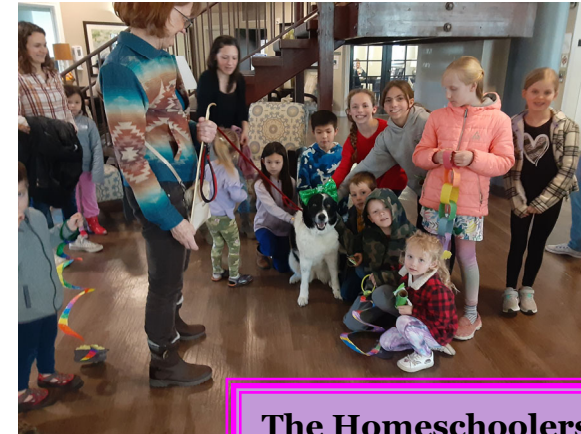
The Homeschoolers met Indie