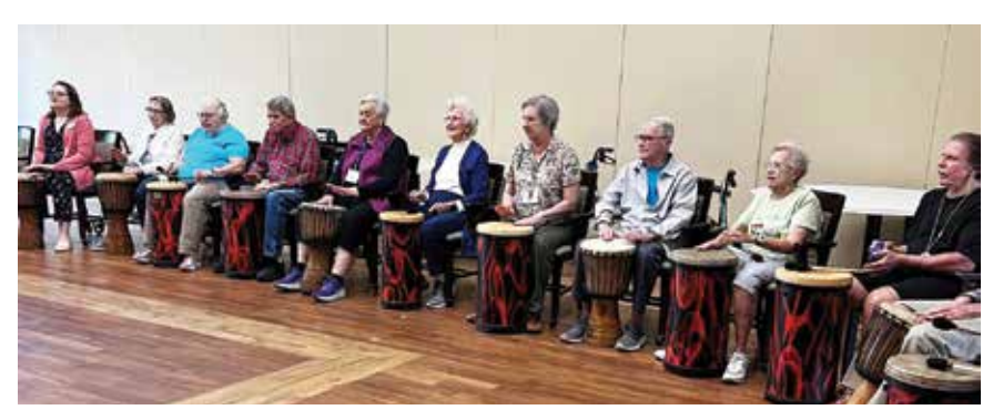
Columbia residents and staff kicked off Active Aging Week with a Drumming Circle.