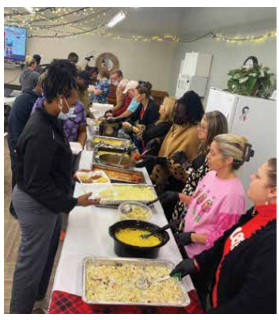
Leadership at the Florence Community served lunch at the staff Christmas party.