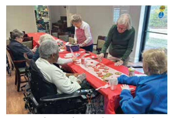
Residents enjoy decorating Christmas cookies.