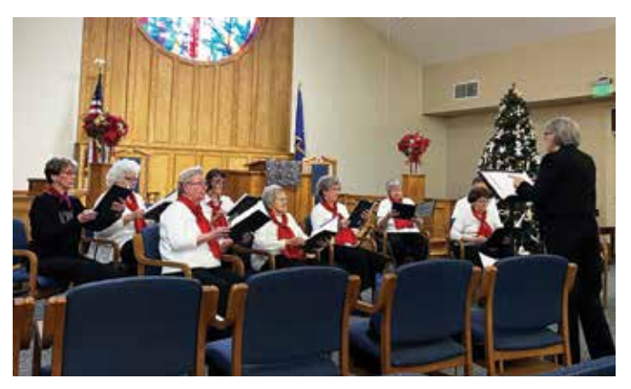
Saints Alive, the Columbia Community's choir helps bring in the Christmas spirit