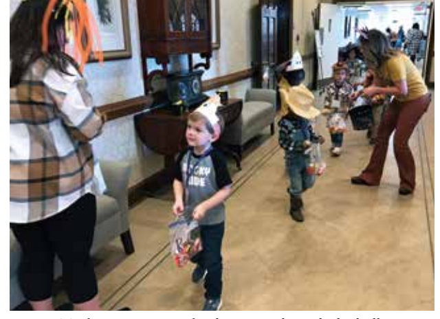
Trick-or-treaters make their way through the halls.