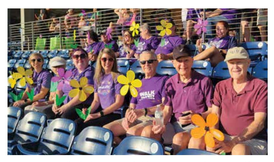
It was a great day for the Walk to End Alzheimer's in Greenville at Fluor Field.