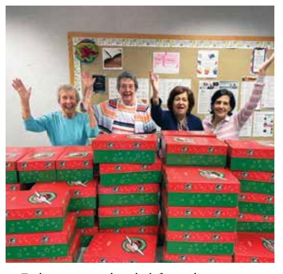
Each year our residents look forward to supporting Operation Christmas Child in partnership with First Presbyterian in Greenville. There is a lot of excitement and participation from residents and staff.