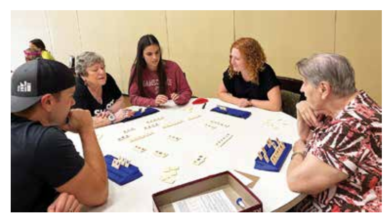
September is National Intergeneration Month, and we were so grateful to spend time this weekend with the youth of Downtown Church (above and below). These middle schoolers and their church leaders taught us some fun, new to us games. Laughter could be heard all the way down the hall. We all want to do it again soon.