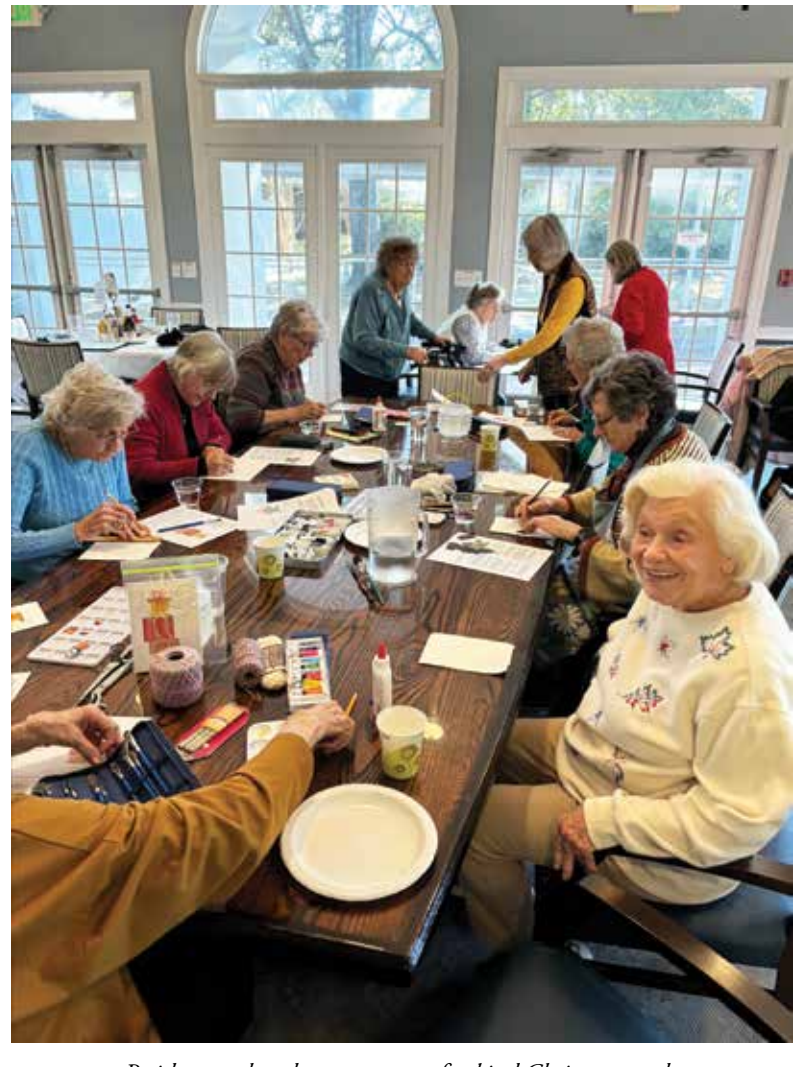
Residents gathered to create one-of-a-kind Christmas cards.