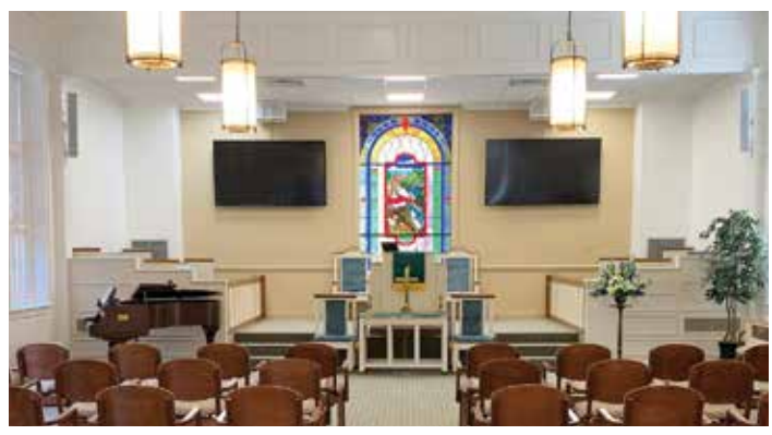
The renovated Chapel at the Florence Community.