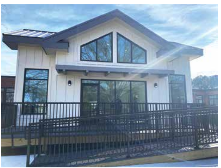
Interior and exterior views of the newly completed Pavilion at the Florence Community.