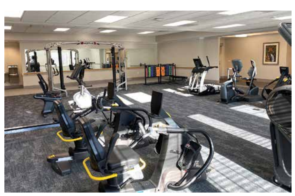
The new Wellness Center at the Foothills Community.

Projects like these are made possible by generous donors, blessing PCSC with planned gifts to