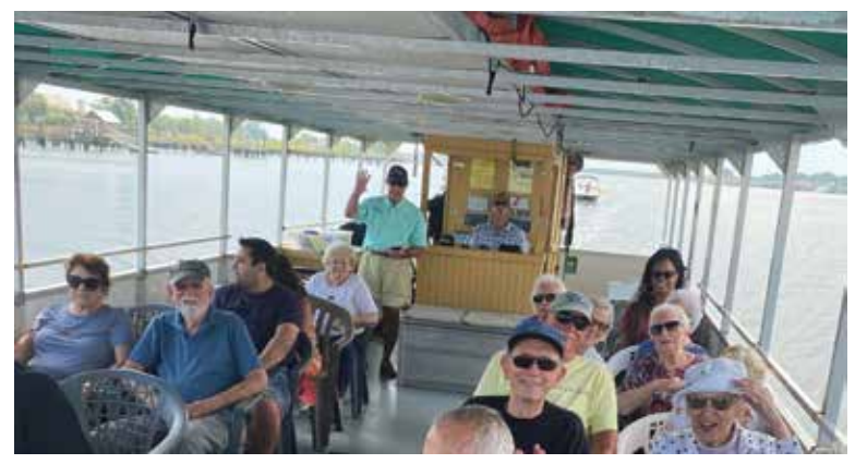
The residents enjoyed an autumn boat ride with "Cap'n Rod's Lowcountry Tours" (above) followed by a wonderful picnic (below)!