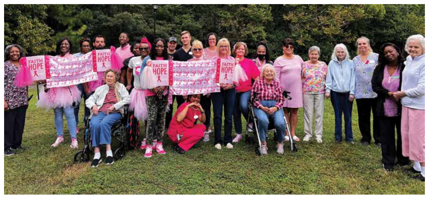
The Columbia Community had a wear pink for breast cancer awareness day and walked together to do a prayer and balloon release. This was a great way to come together for a good cause.