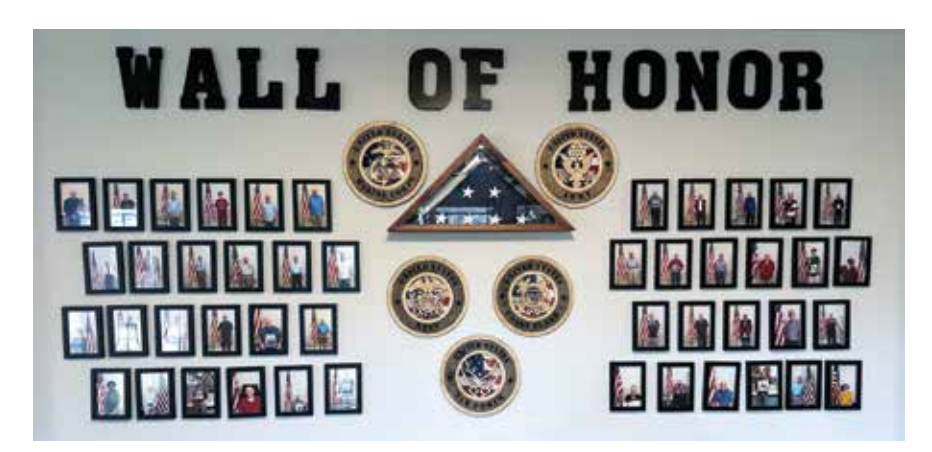
We revealed our Wall of Honor on Veterans Day showcasing all current residents and staff members who served in the military. This was a very special day at our community.