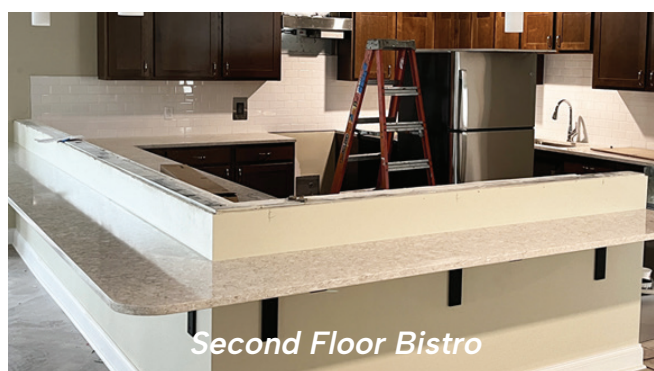
Second Floor Bistro