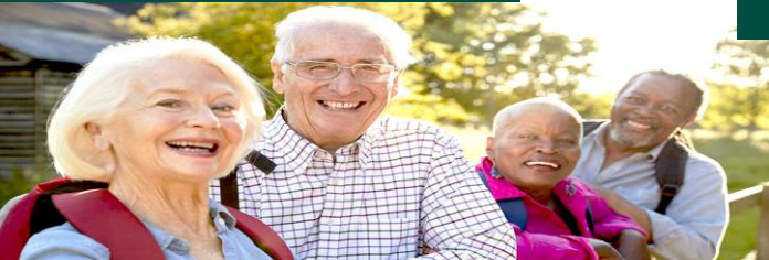
FRIENDS & FAMILY REFERRAL PROGRAM!