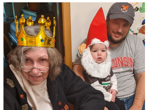
Fun dressing up for trick or treat