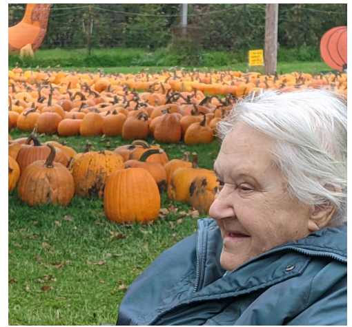
Pumpkin farm outing and Happy Hour carving