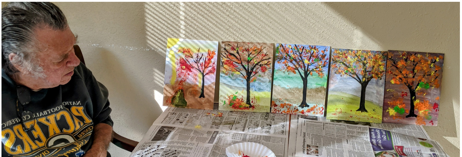
Keith showing off our Autumn art