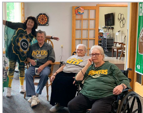
Packers vs. Bears