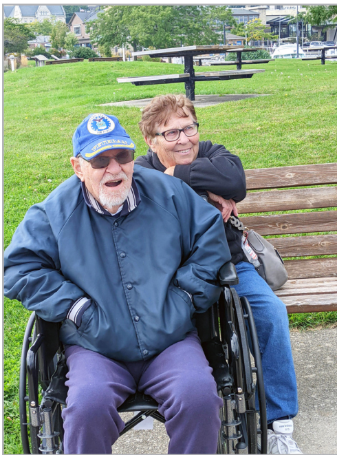
Outing to the Marina