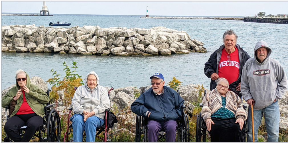
Outing to Port Washington Marina