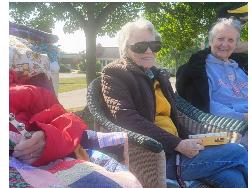
More photos inside!

Newsletter Production by PorterOneDesign.com