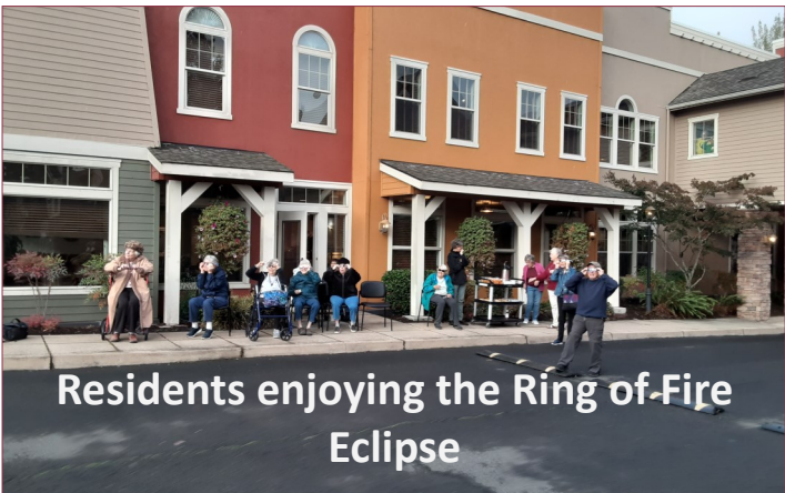
Residents enjoying the Ring of-Fire Eclipse