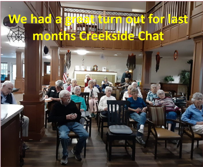
We had a great turn out for last months Creekside Chat

We would love to hear additional ideas from you about the ways you support veterans on our Facebook post for this month's newsletter on the first of November.