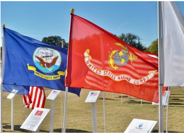
Do you know all of the branches of U.S. Armed Forces? There are six: the Air Force, Army, Coast Guard, Marine Corps, Navy, and Space Force.

Display and use your American flag properly. Rules of thumb include not hanging the flag upside down or backwards and if you hang it vertically, have the stars on the viewer's left. Also, don't let the flag touch the ground. On Memorial Day, have the flag at half-mast from sunrise to noon then at full-mast the rest of the day.