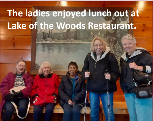
The ladies enjoyed lunch out at Lake of the Woods Restaurant.