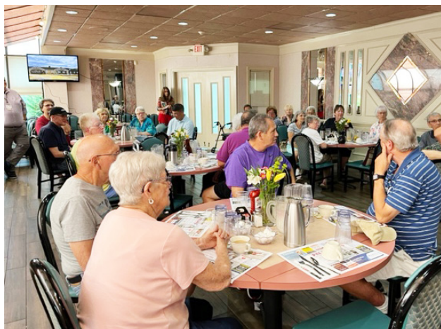
Brunch at The Palace

Have questions about The Birches? Call to arrange a personal visit or to sign up for an upcoming event.