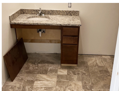
Memory Care Bathroom

See the progress for yourself! Our Welcome Center is open Monday-Friday, 9 a.m.-5 p.m.