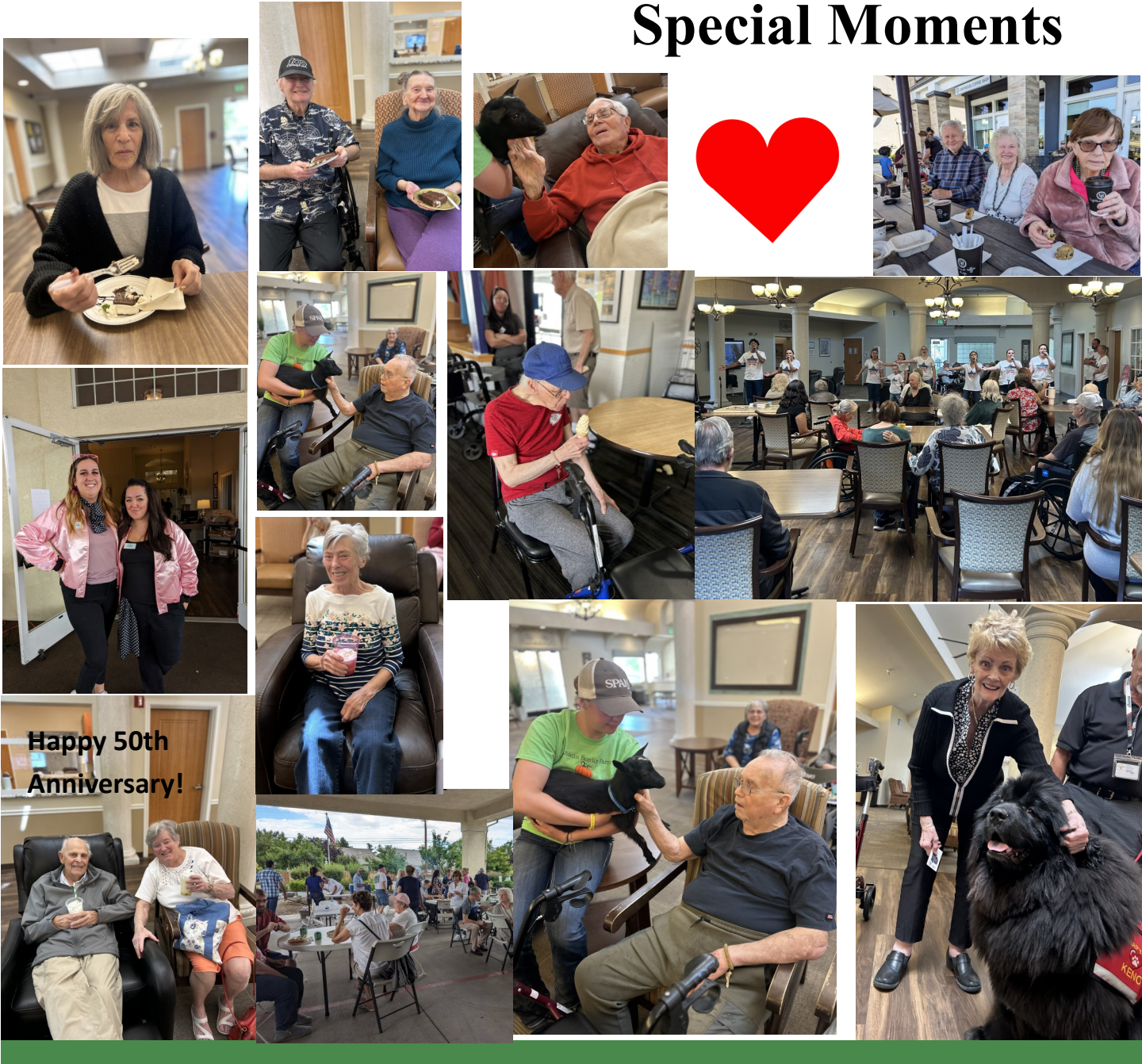
Happy 50th Anniversary!