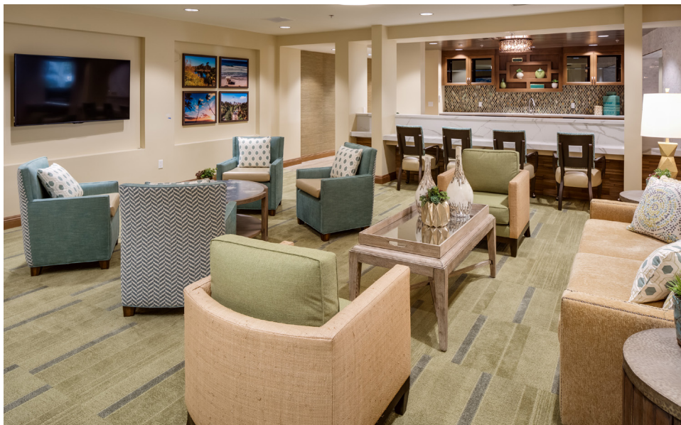
Top center: Meet up with friends and neighbors for a cup of coffee in our Bistro Cafe. Bottom left: Weekly movies, educational presentations, and fun-filled trivia games, our flexible Theater space makes room for it all!