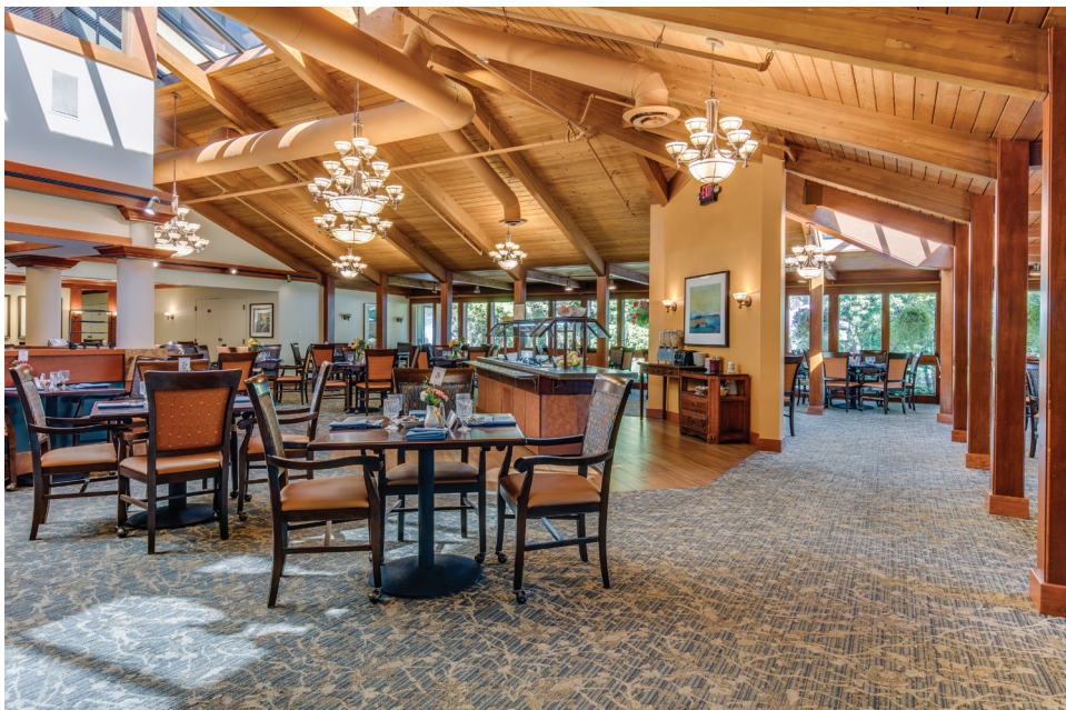
Top center: Residents enjoy all-day dining allowing them to eat when it fits into their active schedule. Bottom left: Enjoy fresh air among our lush landscaping and raised bed garden.

a hospital, or moving to a senior living community, consumers go to U.S. News to research and make consequential life decisions.