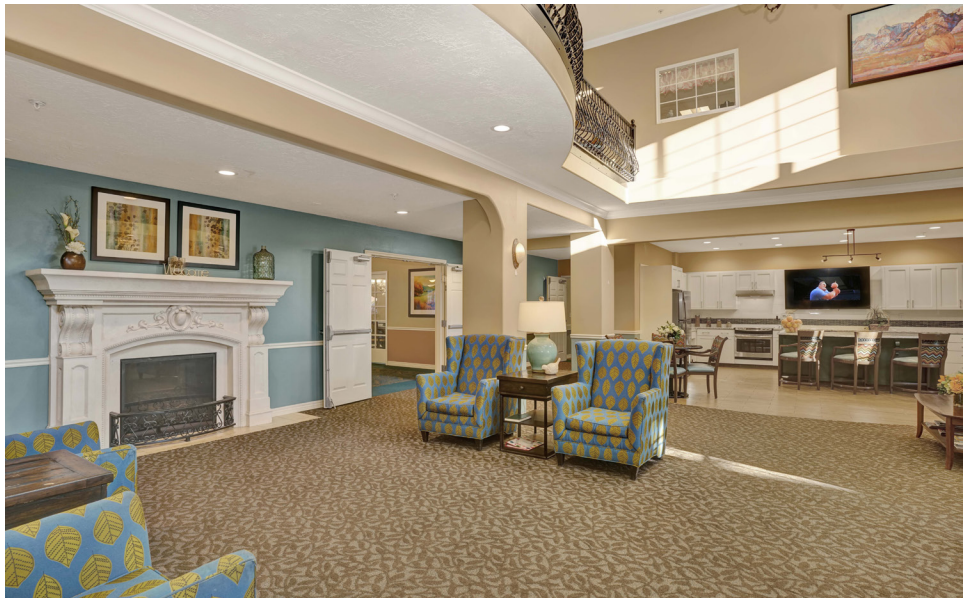
Top center: Our open, well-appointed lobby and adjacent Bistro is our community's focal point for residents to connect.