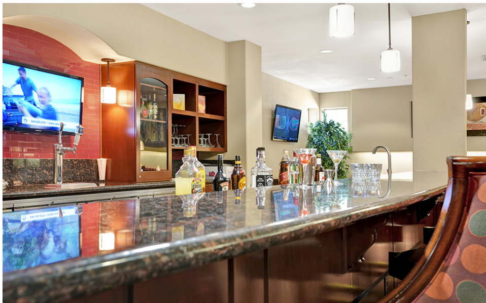
Top left: McDowell Village's grand entrance welcomes you. Top center: Enjoy gathering with friends and neighbors for social hour in the Village Room. Bottom left: Enjoy relaxing poolside or joining in on an invigorating water aerobics class.

arbiter of quality across a variety of important choices. Whether picking a college, selecting a hospital, or moving to a senior living community, consumers go to U.S. News to research and make consequential life decisions.