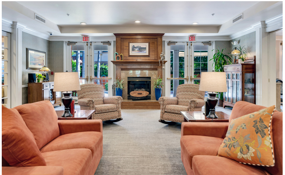
Top center: Inviting spaces inside and out for residents to gather with friends and family, like our cozy living room. Bottom left: Enjoy the fresh air and lushly landscaped grounds while strolling in the courtyard.

hospital, or moving to a senior living community, consumers go to U.S. News to research and make consequential life decisions.