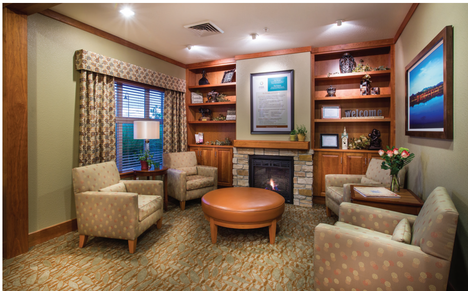
Top left: As an MBK Senior Living community, our residents thrive in our culture of care. Top center: Cozy spaces invite residents and families to visit or relax with a good book. Bottom left: Residents enjoy strolling in our secure and beautifully landscaped courtyard.