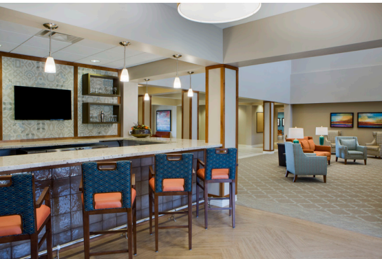
Top center: Inviting spaces inside and out for residents to gather with friends and family. Bottom left: Enjoy a light snack or cup of coffee in our Bistro Cafe, located just off the lobby.

Conveniently located in north Gilbert, Savanna House offers assisted living and memory care services in an inviting setting and complete with numerous amenities, high-quality services, and engaging programming.