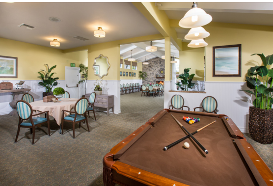
Top center: Inviting spaces inside and out for residents to gather with friends and family. Enjoy visiting poolside, or join in on an aqua-aerobic class. Bottom left: Fun and games abound in a variety of shared spaces, including billiard and game room.

A hidden gem with strong roots in Huntington Beach, Huntington Terrace is a vibrant, active, and caring senior living community with an enviable reputation for excellence over many years. Service and support to residents are delivered by a compassionate team who loves what they do and cheerfully embraces residents as family.