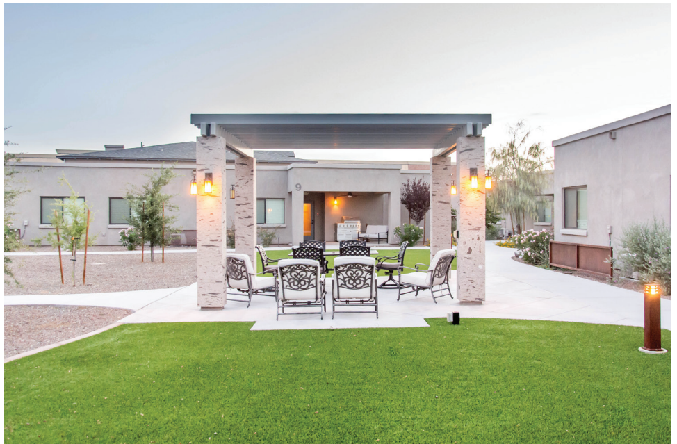
Top center: Our secure courtyard provides ample shaded seating and pathways for residents to enjoy daily walks. Bottom left: Bright, inviting living rooms in each casita welcome residents and families.

consumers go to U.S. News to research and make consequential life decisions.