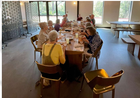
Lunch at Moonraker