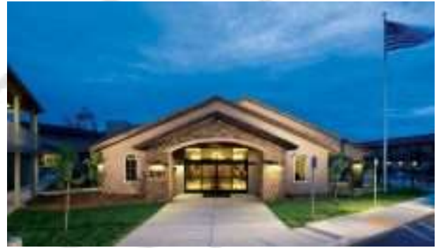
Ponté Palmero Resort-Style Living