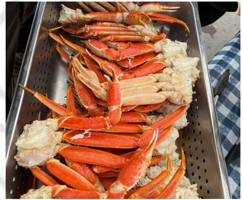
Enjoying lunch after a morning swim