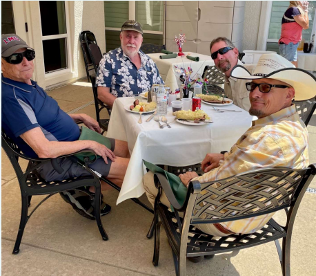
Father's Day BBQ!