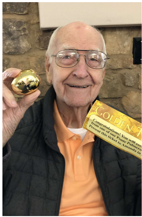
Our lucky Golden Easter Egg winners!