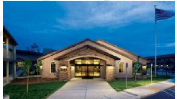
Ponte Palmero Resort-Style Living