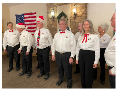
Gold Rush Chorus