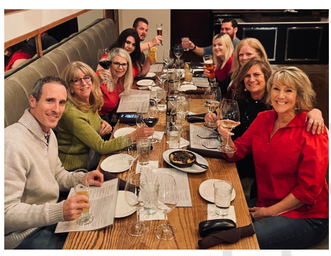
Director's holiday dinner