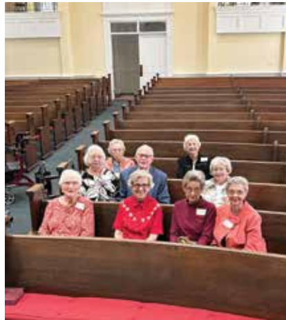
A group hear the history of Williamsburg Presbyterian Church during a visit to Kingstree. It is one of the oldest churches in SC, dating back to 1736.