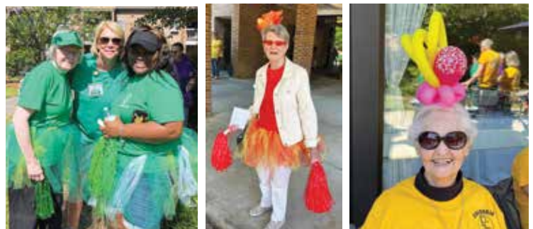
Above (L-R): Cheering on Summerville, Clinton and Columbia!