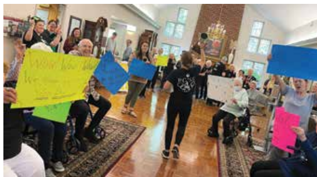
Residents and staff of the Foothills Community gathered to welcome home this year's trophy and congratulate all participants in the PCSC Olympics.