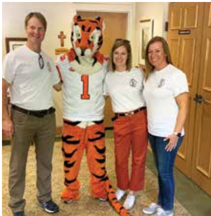
The Clemson Tiger even came to the event!

When all was said and done, the Foothills Community emerged as the overall winner of the competitions, and The Village at Summerville captured the coveted Spirit Award.