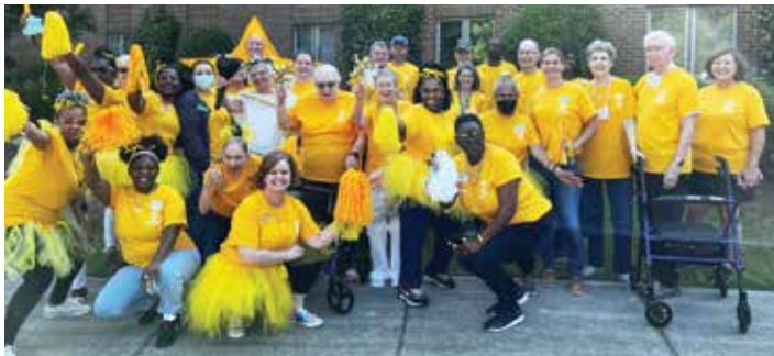
Olympians and cheerleaders from the Columbia Community.

Congratulations to all who participated and assisted in the games. The day was filled with high-spirited laughter, connections with new and old friends, high-fives, and loads of fun. In our book, everyone who participated was a winner! Plans are already underway for the 2024 PCSC Olympics.