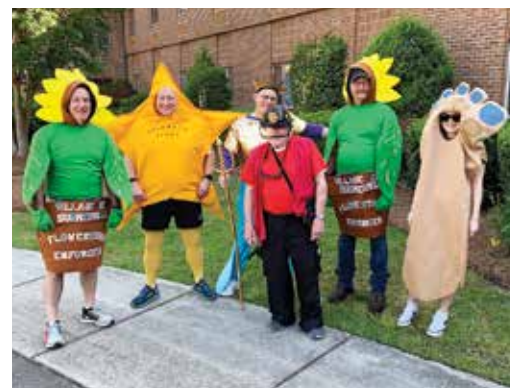
Mascots helped cheer their communities.