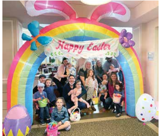
We had an EGG-citing good time with our Easter Egg Hunt for residents, team members and their families.