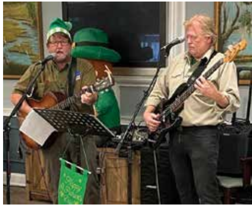
The Irish Duo

The Village at Summerville celebrated St. Patrick's Day at a gathering that included music from The Irish Duo, tasty sweets and all things green!