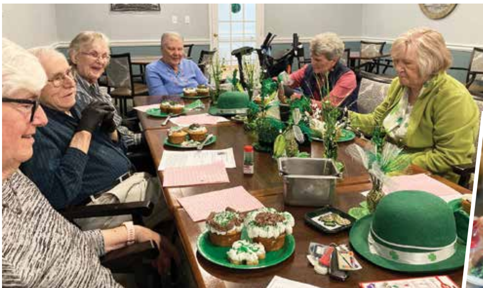
Residents try their hands at cake decorating for St. Patrick's Day.