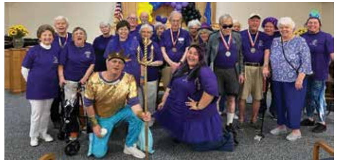
The Laurel Crest mascot and team members with their medals.