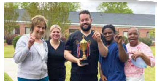
Team Therapy proudly poses for the Inaugural Winning Trophy of the 2023 Department Wars!