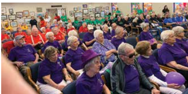
Olympians from all communities await the awards presentation.