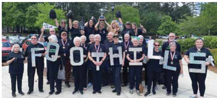
The Foothills Community, showing off their trophy for overall winner.