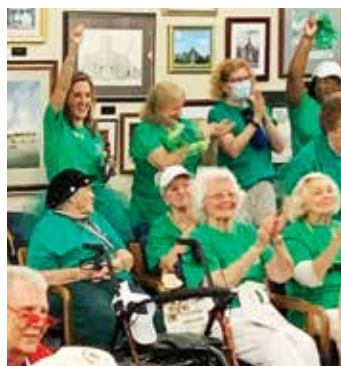
The Village at Summerville celebrates winning the Spirit Award.