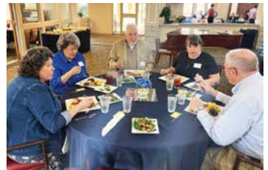
Members of the Foothills Presbytery renew friendships and discuss the work of the presbytery over meals skillfully prepared by the Foothills Community culinary team.