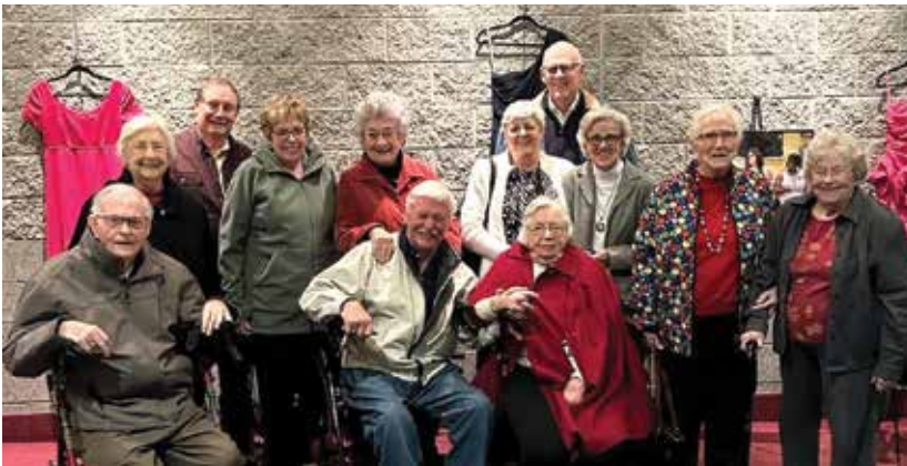
Bravo! Residents all smiles after watching "Always a Bridesmaid" at the Florence Little Theater.